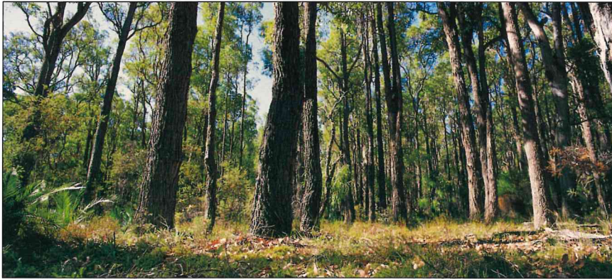
Jarrah regrowth forest

Through conscientious forest management and dedicated development by downstream processors, natural feature-grade timber is now being used in a range of highly sought after timber products, especially furniture and flooring.