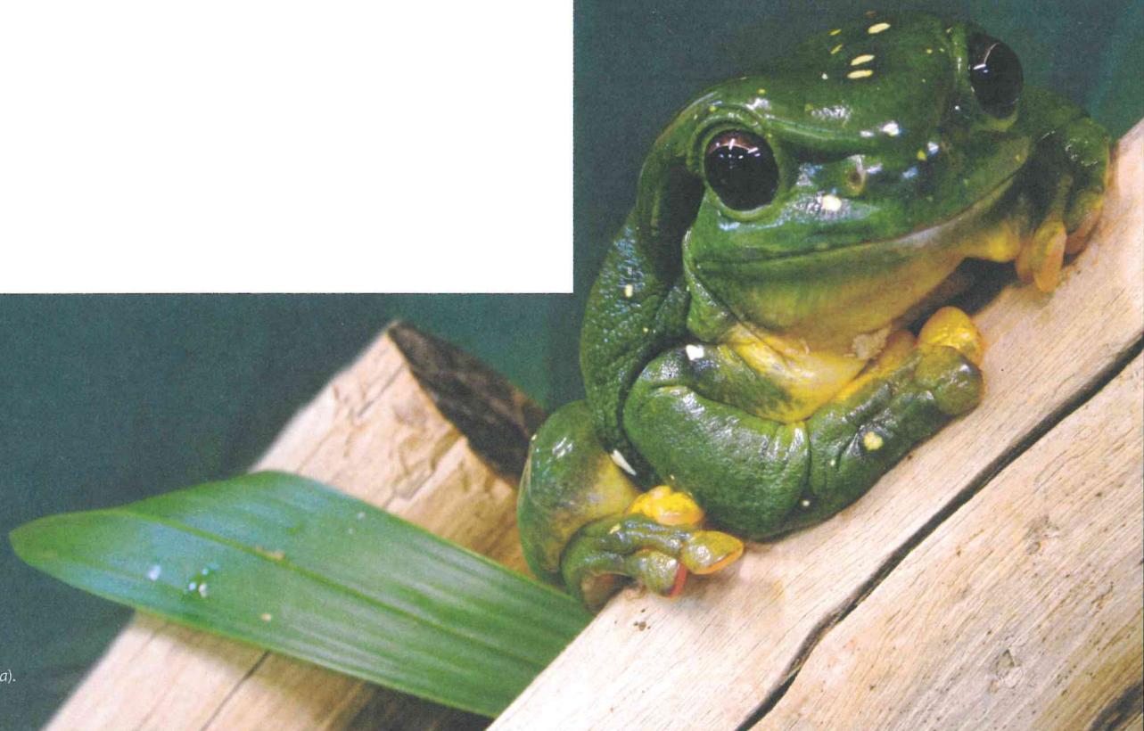
Splendid tree frog ( Litoria splendida ).