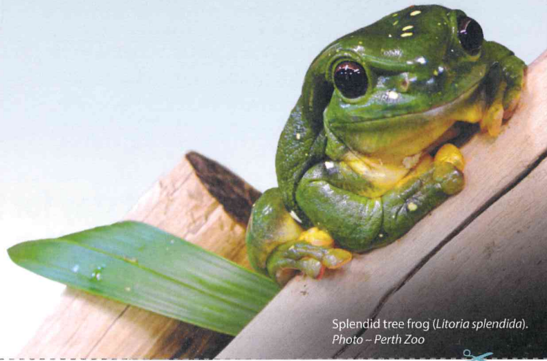
Splendid tree frog ( Litoria splendida ).