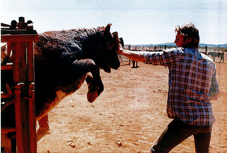
□ "Mustering at Mount Augustus Station"