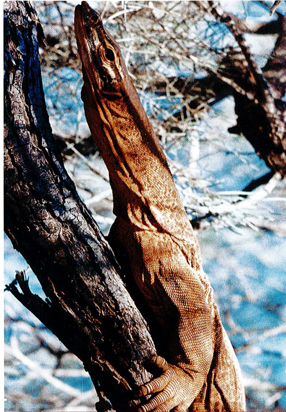
□ Local Bungarra

Mount Augustus is fast becoming a mecca not only for overseas visitors but also for geologists, botanists, ornithologists, cavers, climbers, hikers and nature lovers in general.