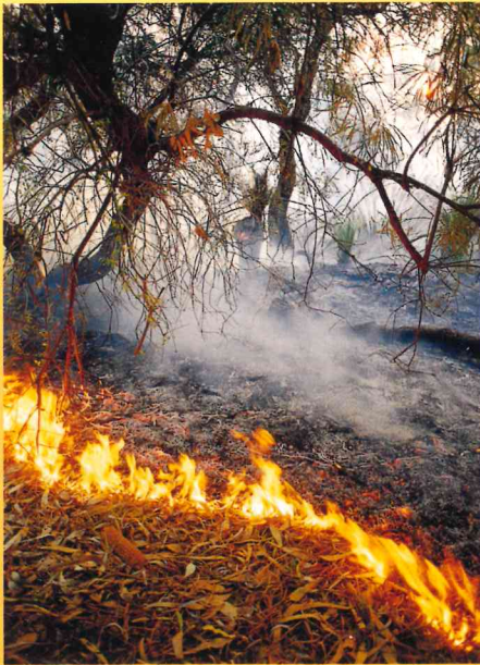
Low intensity planned burns consume ground fuels and reduce the severity of summer wildfires.