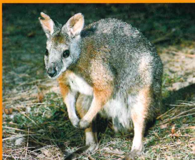
Tammar wallabies require fire-induced thickets in streamlines for refuge during reproduction and for protection from predators.

Fires are also used to protect or regenerate animal habitats and to promote the growth of vegetation on which native animals feed, such as the thickets growing alongside streams where tammar wallabies and quokkas live. These thickets need periodic fire—about every 15 to 25 years—to regenerate. Therefore, strategic fuel-reduced buffers are needed in adjacent areas to protect their habitat from the ravages of wildfires.