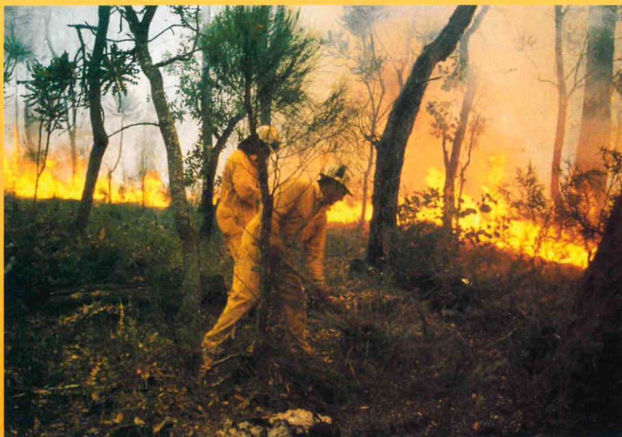
Each year CALM firefighters battle hundreds of wildfires throughout the south-west forests.

Aboriginal people have used fire for more than 40,000 years for heating, cooking and for clearing the country to enable easier access for hunting, as well as to stimulate regrowth of native grasses to attract native grazing animals. Aborigines also used fire to create buffers to help protect them against the ravages of wildfires.