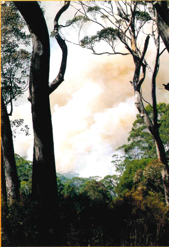
Smoke from CALM planned burning is diverted away from population centres by accurate weather forecasting and burn scheduling.

CALM crews, sometimes with the assistance of local volunteer fire brigades, constantly monitor progress while the burn is under way and then mop up and patrol the edges to ensure the fire is safe.