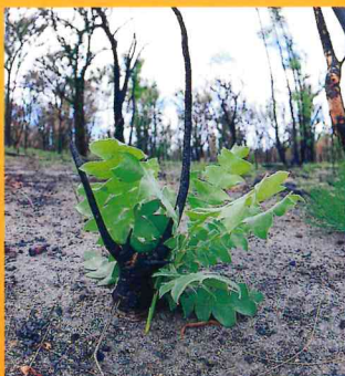
A bull banksia resprouting after fire.

Fuel reduction burns lit under mild weather conditions are low intensity, slow moving fires that creep across the forest floor consuming the leaves, twigs and bark. Not all the fuel is burned. These types of planned fires are designed to leave a mosaic of burned and unburned pockets to create a patchwork effect. Once forest fuels are reduced, a crown fire will not develop—even under extreme weather conditions.