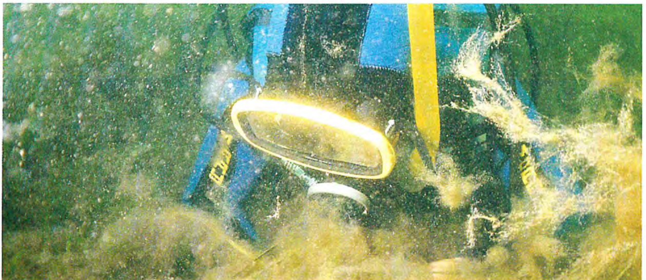
Figure 2c. Filamentous alga (epiphyte) covering Posidonia sinuosa in the eastern part of Princess Royal Harbour, 4.5 m depth, November 1986. Note seagrass is almost totally covered with alga.