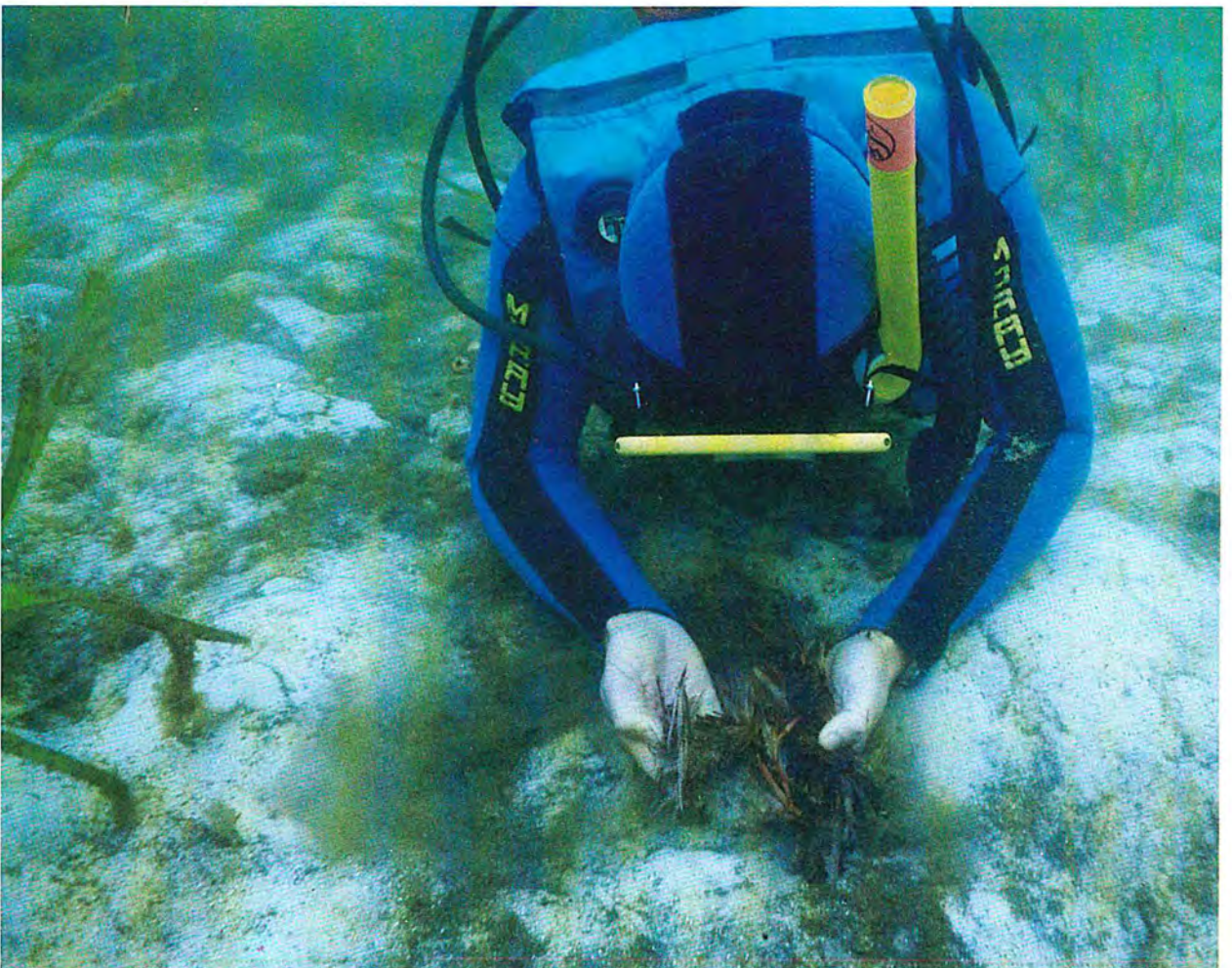
Figure 3b. Diver examining remains of seagrass leaf – bases and rhizomes dug out from under the sand. This indicated a seagrass bed once covered the site. Photograph taken in the eastern end of Princess Royal Harbour, 4.5 m depth, November 1986.