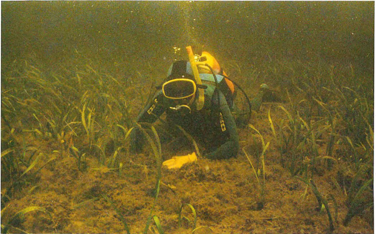
Figure 3a. Posidonia australis and P. sinuosa in the western end of Princess Royal Harbour, 1.5 m depth, November 1986. Note seagrass here is very sparse, probably due to the quantity of smothering benthic algae.