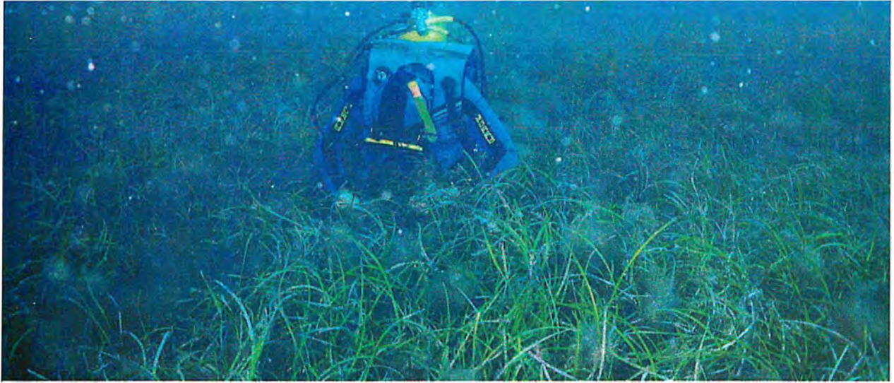
Figure 2a. Posidonia sinuosa bed at 15 m depth in Frenchman Bay, January 1987. Note dense, healthy seagrass.