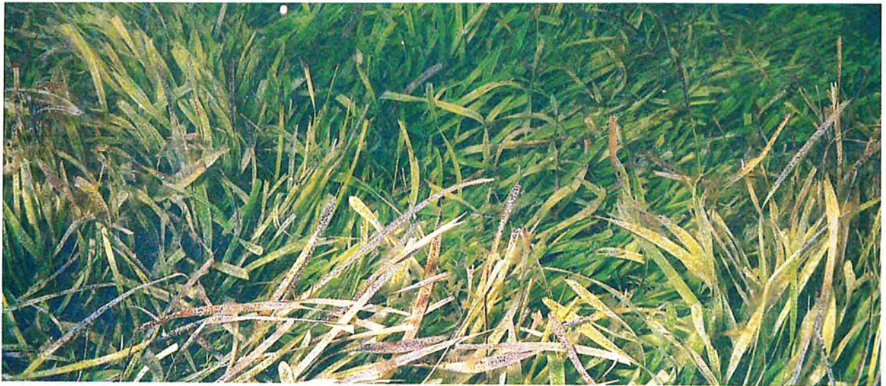
Figure 2b. Posidonia australis bed at 1.5 m depth in Frenchman Bay, January 1987. Note dense, healthy seagrass, relatively free of epiphytes.