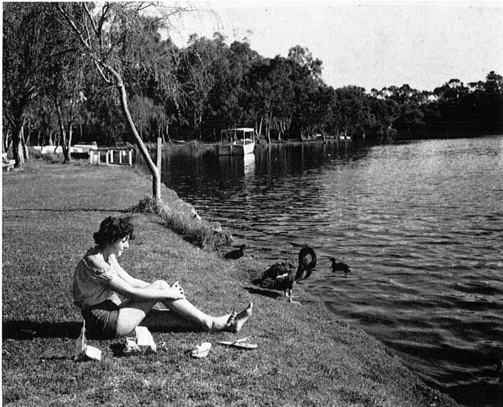
On the shores of Loch McNess, Yanchep Park

A small block of toilets adjacent to Coalmine Beach was completed during the year and should meet the requirements of day visitors, without the necessity for them to use those provided in the nearby caravan and camping area as in the past.