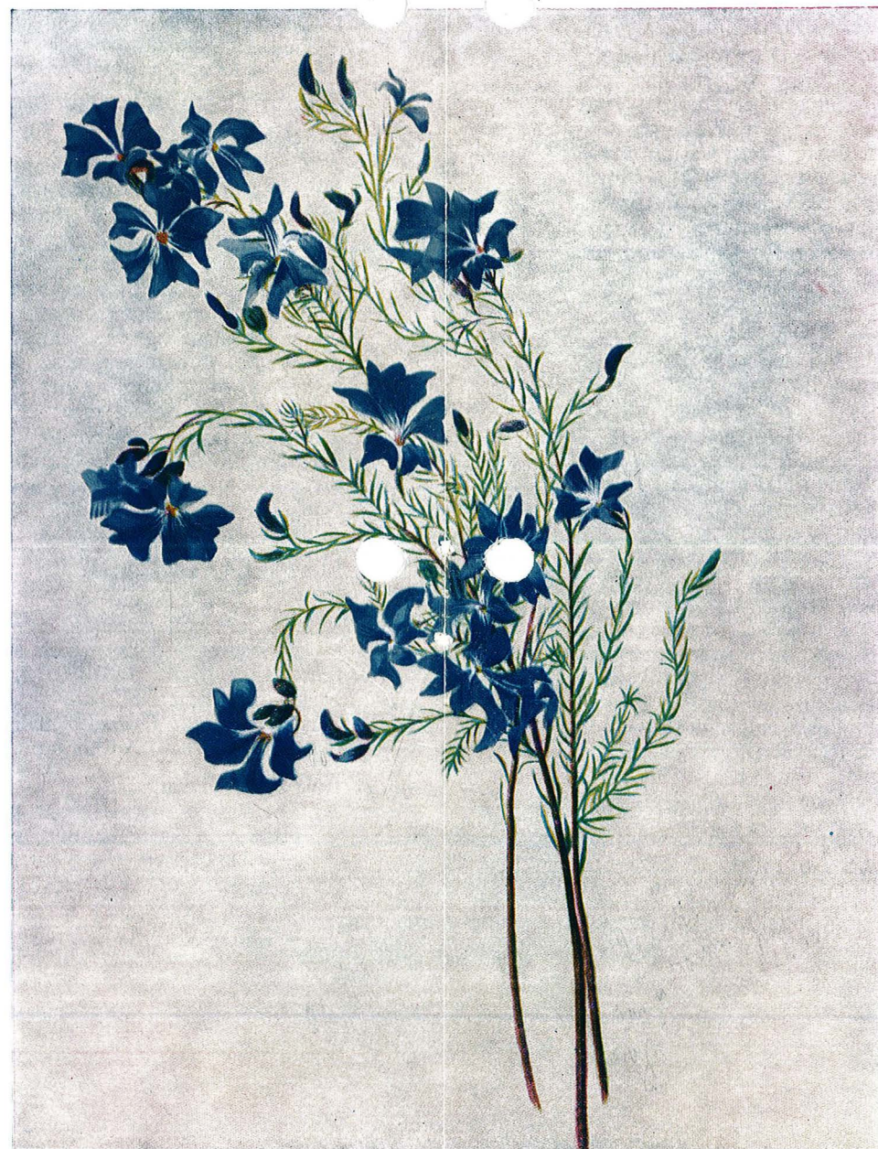
Blue Leschenaultia ( Leschenaultia biloba )