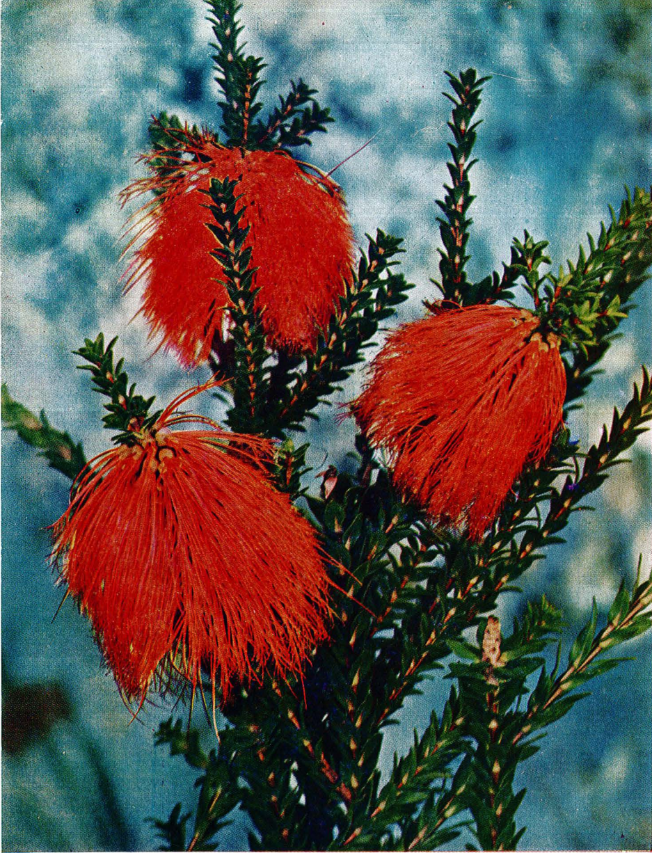
Scarlet Swamp Bottle Brush ( Beaufortia sparsa )