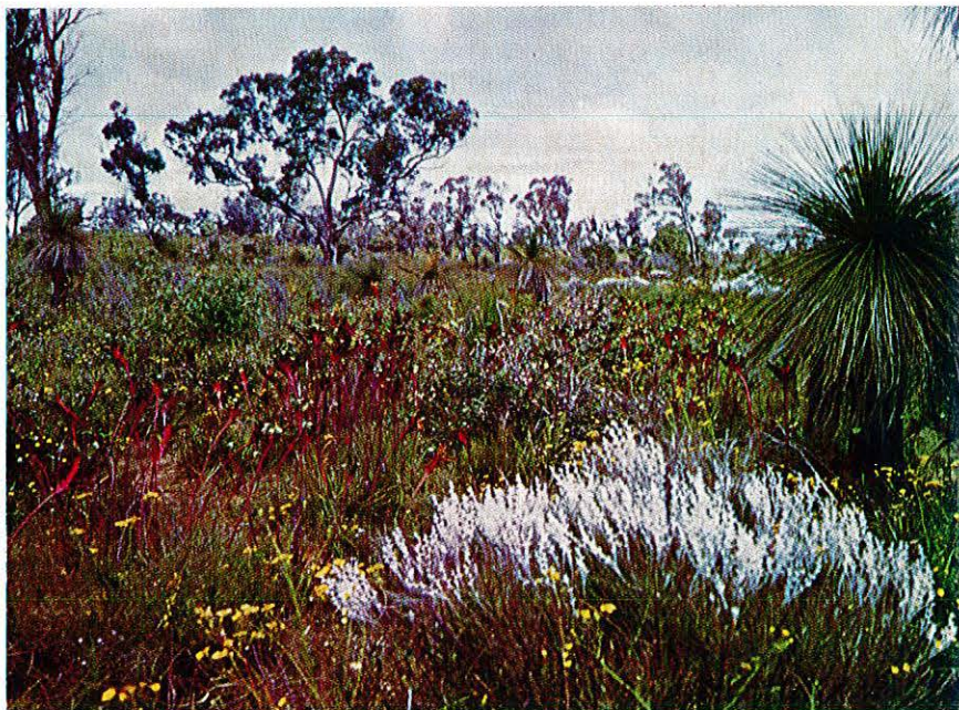
A view near Crystal Cave, Yanchep Park W.A. (Red and Green Kangaroo Paws, Smoke Bush, Blackboys and Tuarts)

This reserve comprises a long narrow strip of territory lying between McNess Drive and the Canning River, and extending from