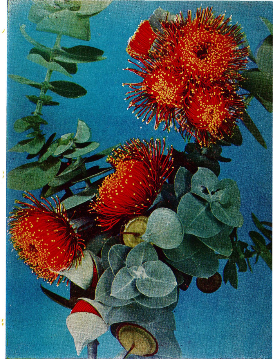
Mottlecah ( Eucalyptus macrocarpa )