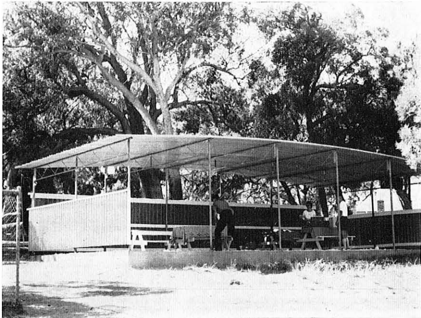
Picnic Shelter, Yanchep Park, W.A. (Erected 1965)