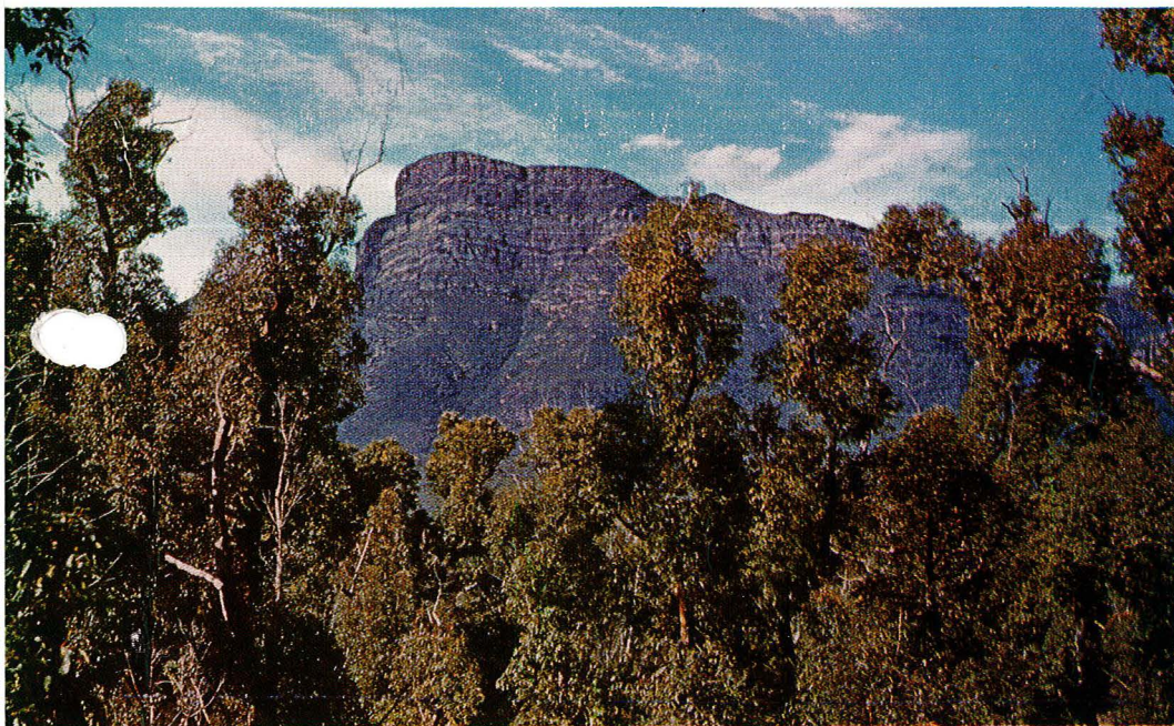
Bluff Knoll, (3,640 ft.) Stirling Range National Park, W.A.