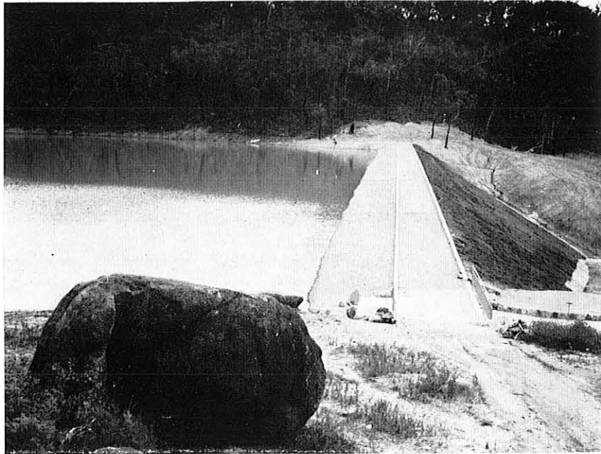
Glen Brook Dam, John Forrest National Park, W.A. (Constructed 1965)

Arrangements are in hand to improve considerably, the existing fire control measures within the Nornalup National Park, involving the expenditure of in the