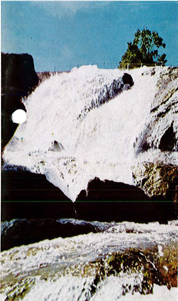
National Park Falls, John Forrest National Park, W.A.

It has been necessary to take proceedings against a few people for contravention of the Board's by-laws.