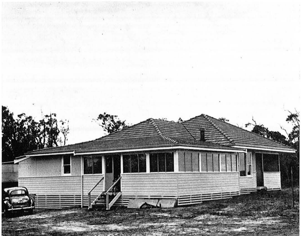
Rangers Residence and Tearooms, Coalmine Beach, Nornalup National Park