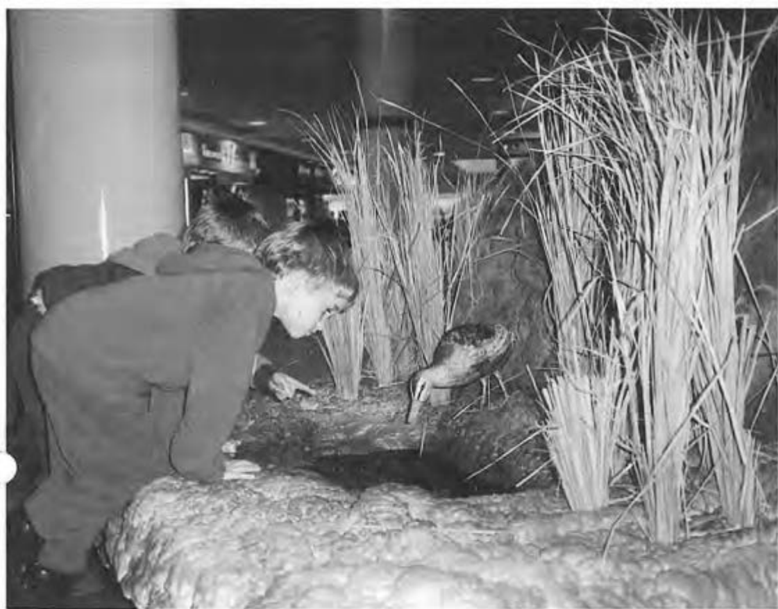
Young visitors absorbed in the wetlands component of Swan Region's Perth Outdoors shopping centre display.