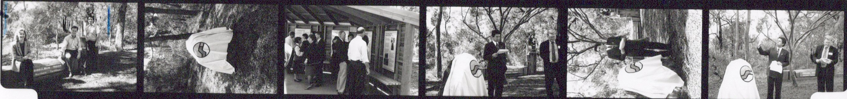
13A KODAK 5053 TMY 14 9 KODAK 5053 TMY 14A KODAK 5053 TMY 15 9 KODAK 5053 TMY 15A KODAK 5053 TMY 16 10 KODAK 5053 TMY 16A KODAK 5053 TMY 17 11 KODAK 5053 TMY 17A KODAK 5053 TMY 18 12 KODAK 5053 TMY 18A KODAK 5053 TMY