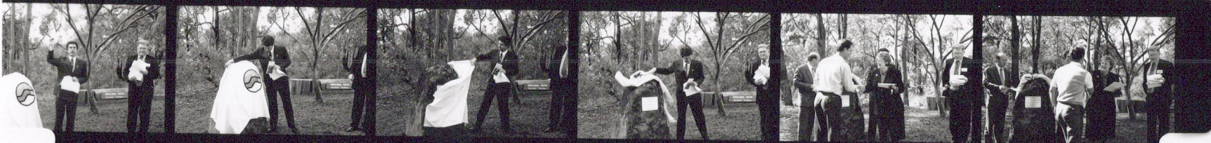
19A KODAK 5053 TMY 20 14 KODAK 5053 TMY 20A KODAK 5053 TMY 21 15 KODAK 5053 TMY 21A KODAK 5053 TMY 22 16 KODAK 5053 TMY 22A KODAK 5053 TMY 23 17 KODAK 5053 TMY 23A KODAK 5053 TMY 24 18 KODAK 5053 TMY 24A KODAK 5053 TMY