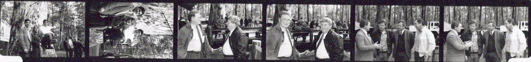
1A KODAK 5053 TMY 2 2A KODAK 5053 TMY 3 3A KODAK 5053 TMY 4 4A KODAK 5053 TMY 5 5A KODAK 5053 TMY 6 6A KODAK 5053 TMY