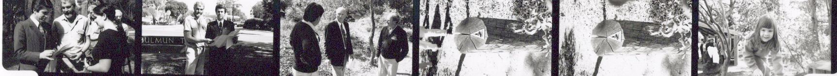
31A KODAK 5053 TMY 32 26 KODAK 5053 TMY 32A KODAK 5053 TMY 33 27 KODAK 5053 TMY 33A KODAK 5053 TMY 34 28 KODAK 5053 TMY 34A KODAK 5053 TMY 35 29 KODAK 5053 TMY 35A KODAK 5053 TMY 36 30 KODAK 5053 TMY 36A KODAK 5053 TMY