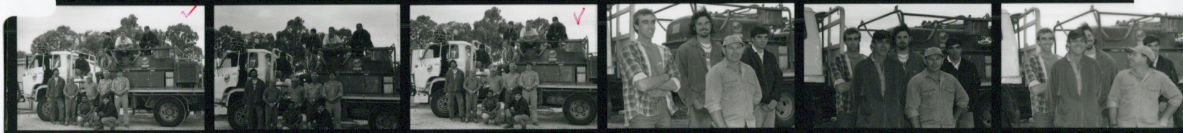
18 A 19 ILFORD FP4 PLUS 19 A 20 8 4 8 20 A 21 ILFORD FP4 PLUS 21 A 22 22 A ILFORD FP4 PLUS 23 23 A 8 4 8