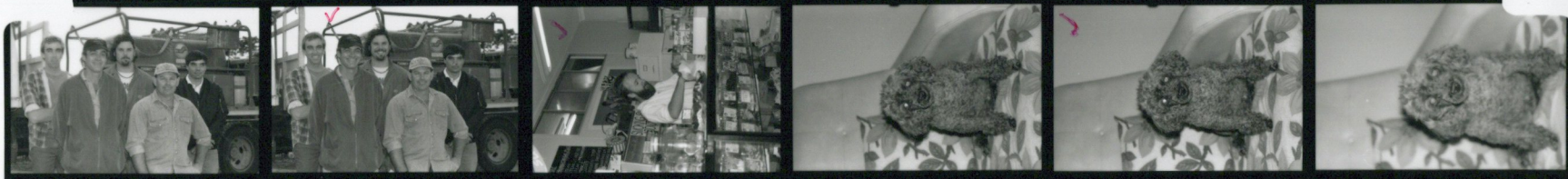
24 A 25 25 A 26 ILFORD FP4 PLUS 26 A 27 8 4 8 27 A 28 ILFORD FP4 PLUS 28 A 29 29 A ILFORD FP4 PLUS