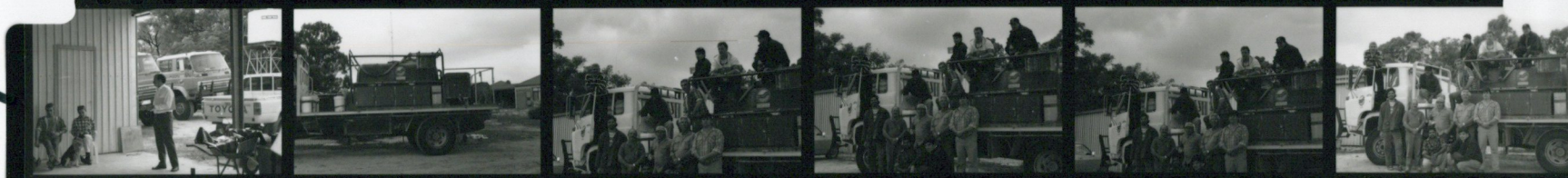
12 A 13 8 4 8 13 A 14 ILFORD FP4 PLUS 14 A 15 15 A ILFORD FP4 PLUS 16 16 A 8 4 8 17 17 A ILFORD FP4 PLUS