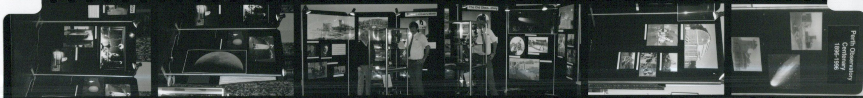
6 A 7 ILFORD FP4 PLUS 7 A 8 8 A ILFORD FP4 PLUS 9 9 A 8 4 8 10 ILFORD FP4 PLUS 11 11 A