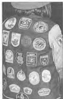
Kristen Appel models the vest to be auctioned.