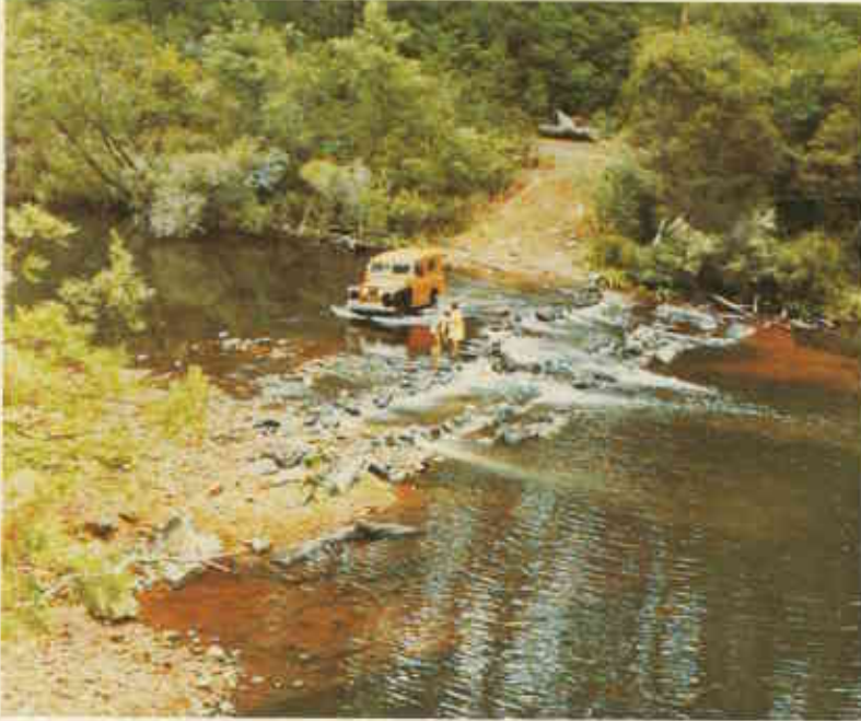
Rocky crossing where Heartbreak Trail meets the Warren River