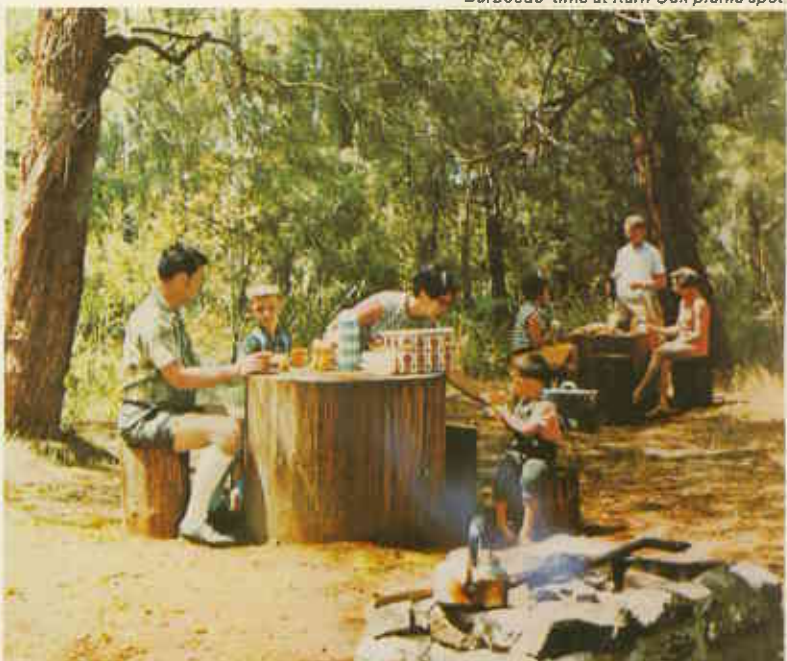
Barbecue-time at Karri Oak picnic spot