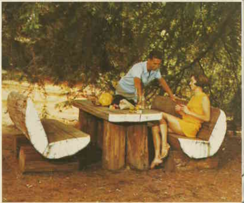
Picnic seats and bench hewn from solid karri logs, at Big Brook Arboretum