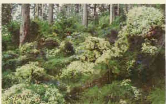
Clematis pubescens and Hardenbergia comptoniana