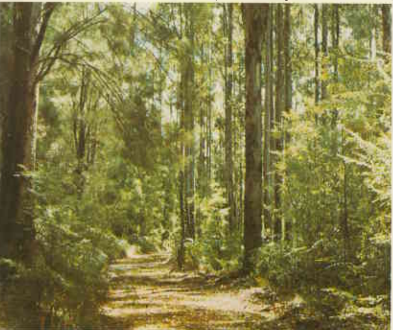
Dense young karri and undergrowth border a side track