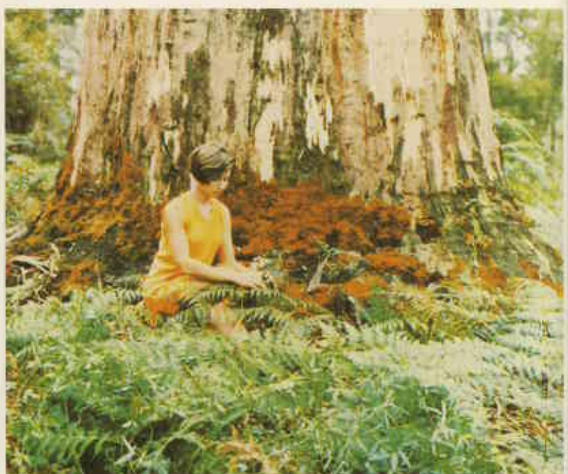
Butt of an 8 ft diameter karri tree, Vasse Road Rainbow Trail winds through vigorous karri regrowth