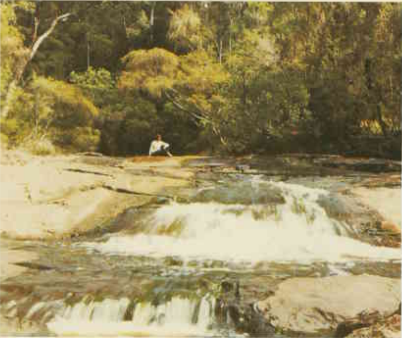
Late summer at the Cascades