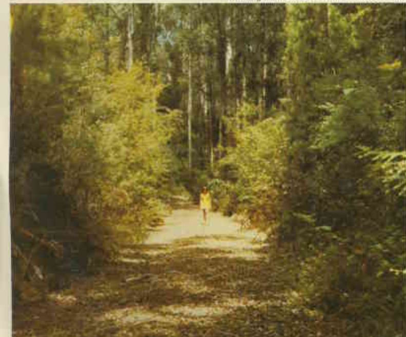
Walking trails branch off the Rainbow Trail