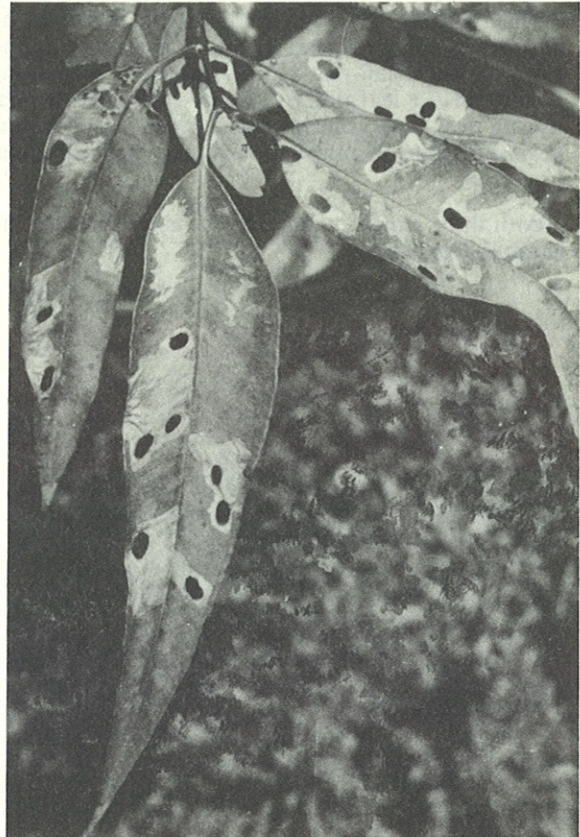
Jarrah leaves showing typical damage caused by larval galleries and the oval holes produced when the larvae drops out of the leaves in cases. Below: moth at rest showing the typical "tail fin" appearance.

To effect control, holes (1 cm by 4 cm deep) are bored into the trunk of the tree. These are placed 15 cm apart and at an angle of 45° to the vertical. In early to mid June a teaspoon of systemic insecticide