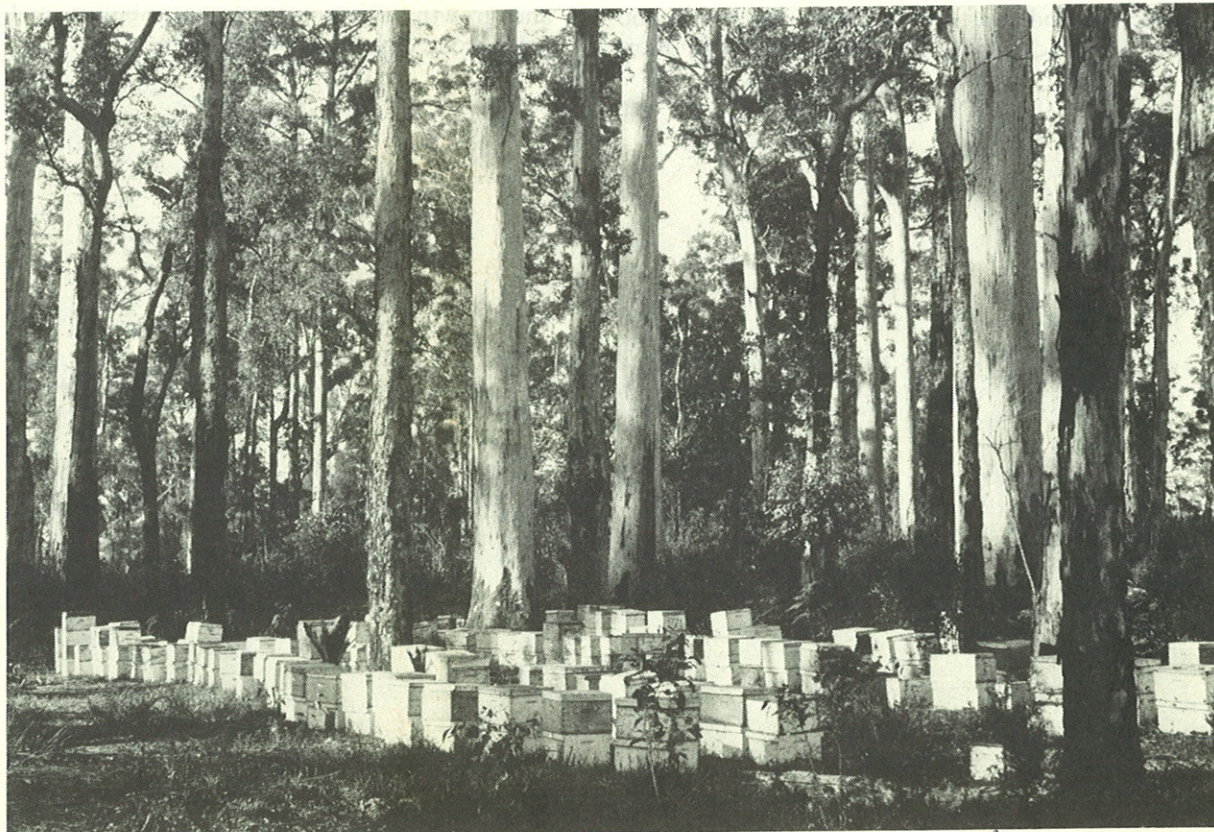
BEE HIVES IN THE KARRI FOREST

Honey production begins when bees visit flowers, collecting nectar in their honey stomach and pollen in the pollen baskets on their hind legs. Pollen and honey are used for feeding young larvae and adult bees. When there is an abundance of blossom the bees collect a surplus of honey which is stored in the combs above the brood nest. It is this surplus honey that the beekeeper removes from the hive. When a field bee or nectar gatherer returns to the hive with a load of nectar she performs a dance to indicate the source of nectar so that other bees are directed to the blossom. After performing her dance she then transfers the nectar load with her tongue to the house bees who store the "unripe"