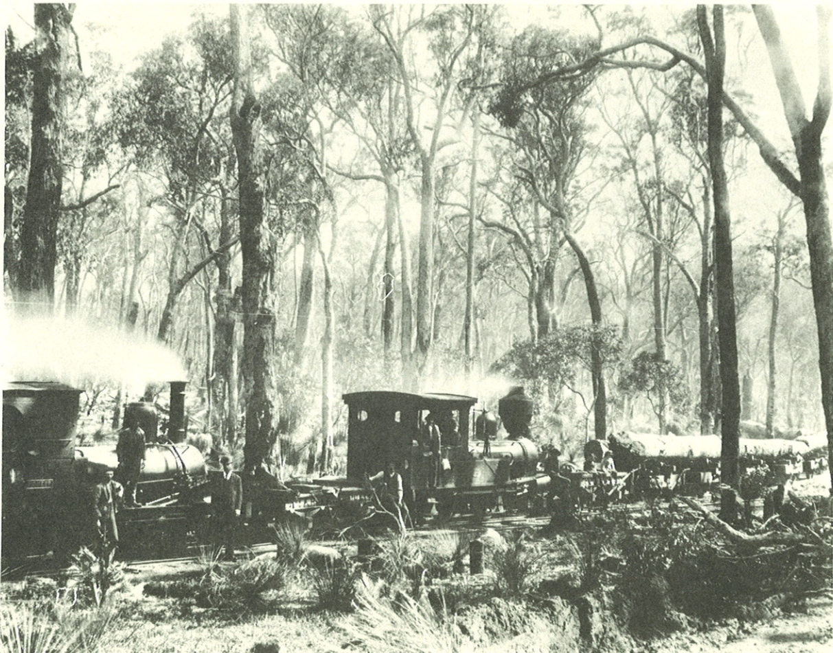
Locomotives "Pioneer" and "Samson No. 2" with rake of logs, Jarrahdale Jarrah Forest and Railways Ltd., about 1897 (became Millars in 1902).

Little can be seen for the first few miles, but as the wintery dawn breaks, huge trees can be seen growing almost to the edge of the line, for this is the heart of the jarrah forest which feeds the mill with logs.