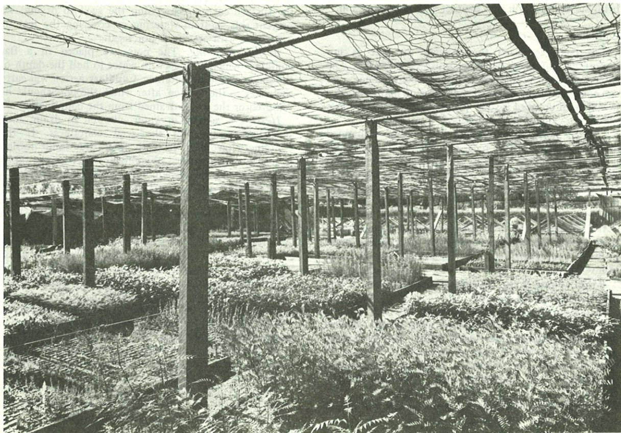
Section of Hamel forest nursery.

The soil used in seed germination should be of a light texture and can be a dark, surface sand or a sandy loam. If the local soil is heavy, it should be broken down by mixing it with equal parts of sand and compost. Strong