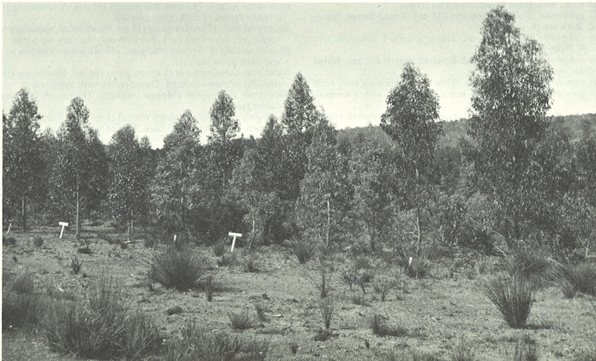
A range of eastern states eucalypts growing on a former dieback area.

The following list has been compiled from a literature search and from assessments of replanted dieback sites. The range and variety is restricted because of the limited amount of research into resistant ornamental species. In areas severely affected, the choice of plants should be restricted to those appearing in this list. In areas not severely affected, the range could be extended by the use of plants which have been noticed growing in similar situations in established gardens. In the deep sands of the metropolitan area, the extensive range of plants which are normally grown can still be used. If a plant is killed by Phytophthora cinnamomi , a resistant species from the list can then be selected.