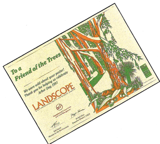
The 'thank you' certificate awarded to each of our young contestants.