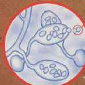
Sporangia release zoospores in water