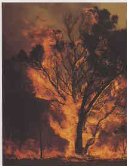
Perth people were devastated when a fire tore through their favourite bushland retreat. But, with Spring, new life and colour is returning.