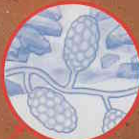
Sporangia, which produce zoospores