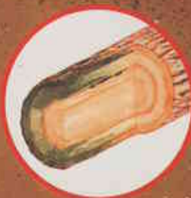
Lesion in root bark