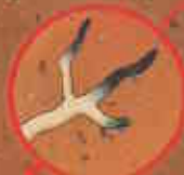
Microscopic mycelium in an infected root