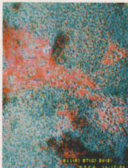
False-colour imagery of jarrah forest. A large infected area shows up in red, while green represents healthy forest.

Hygiene methods developed in State forests are now being adapted to mining and recreation areas as well as to national parks and nature reserves in the South-West.