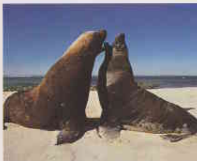
Rottneest isn't the only unspoilt island on Perth's doorstep- what about Penguin, Garden, Seal and Carnac Islands? They are steeped in history and provide a haven for some unique wildlife.