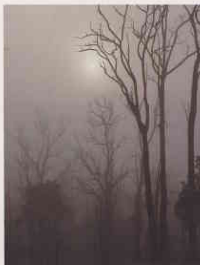
Jarrah dieback- the word strikes fear into any forester's heart- but research is fuelling the fight against the killer fungus.