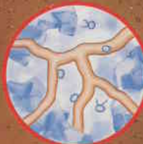
Infection of roots