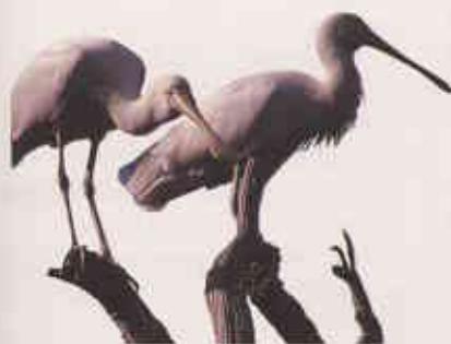
Algae has clogged the estuaries near Mandurah, killing fish and creating an eyesore. What is the solution?