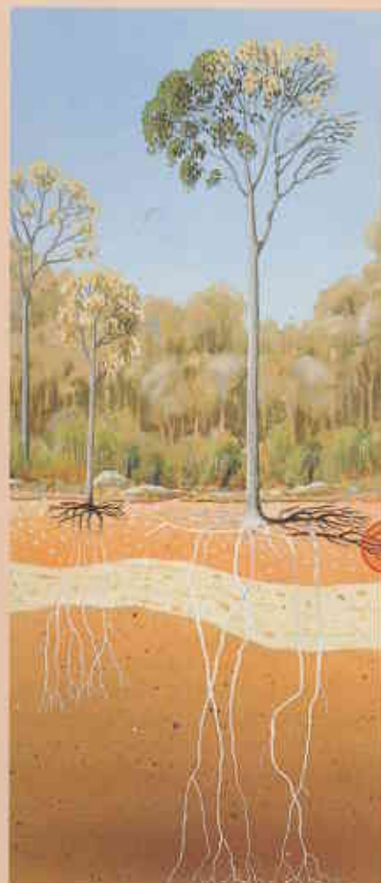
• Crown decline