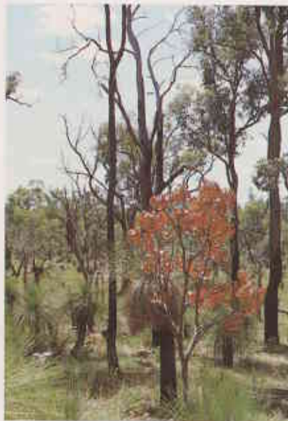
B ull banksia is one of the jarrah forest species most susceptible to dieback, and is the first to die in infected areas.