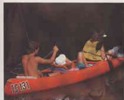
Explore the waterways of the South-West by canoe.