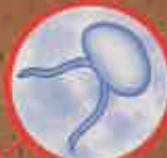
Zoospores can swim to uninfected roots