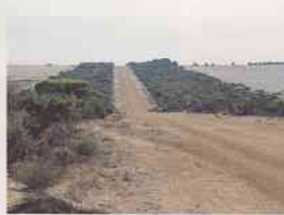
Roadside vegetation often provides vital links between remnant habitats. See our story on page 23.