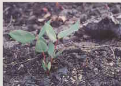
Fire is an important part of Western Australia's environment. Scientists continue to discover just how important. See page 17.