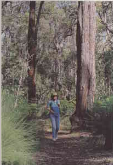
A new CALM book gives bushwalkers a host of short and longer walks in Western Australia's south-west. See page 10.