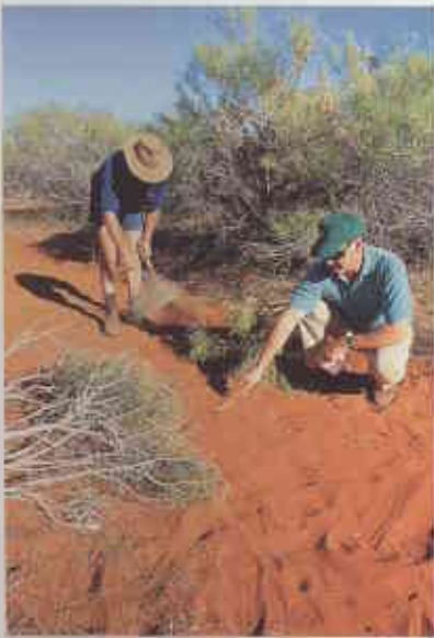
CALM's fight against feral cats gathers ground on Peron Peninsula with the development and testing of a cat bait. See 'Approaching Eden' on page 28.