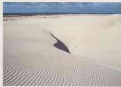
What attracted early pioneers to this barren corner of Western Australia? Find out in 'Eucla Pioneers' on page 35.