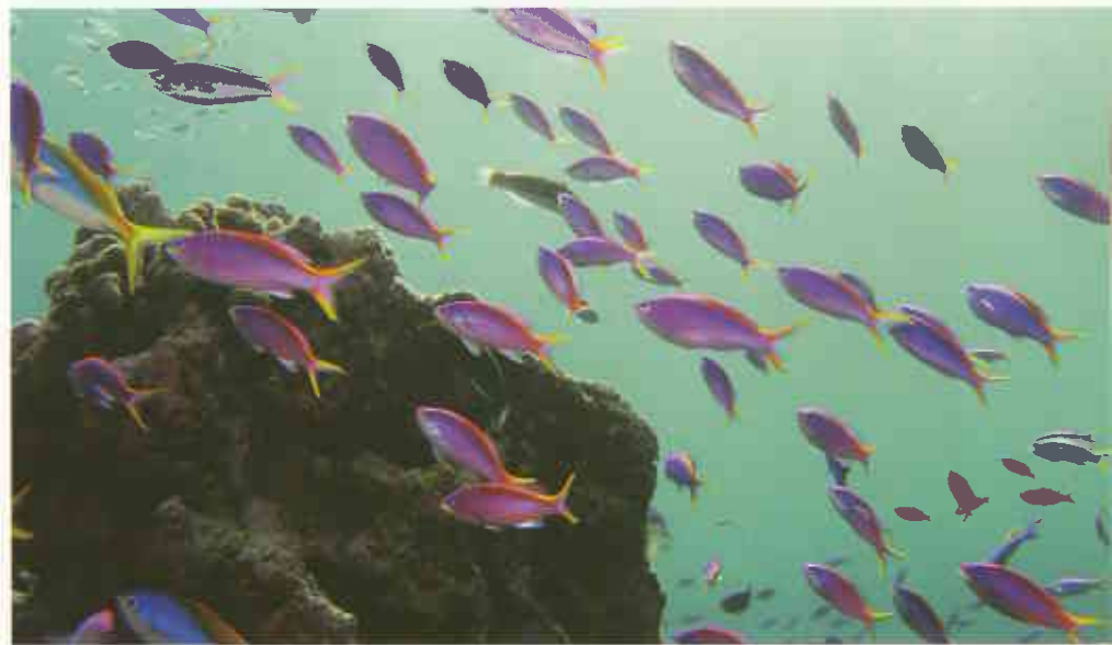
Above Purple anthias at Scott Reef.

and three species of seagrasses have so far been recorded, but the list will no doubt grow once the smaller, cryptic species, mostly growing on the larger seaweeds, are examined in detail. It is the first time many of these species have been found in WA waters, although they have been recorded from tropical reefs in Indonesia and the Philippines.