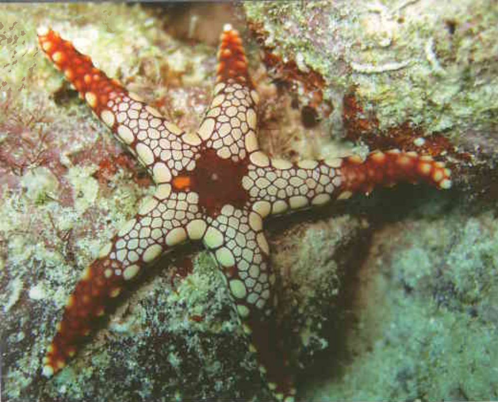
Above The orange marble sea star ( Fromia monilis ).