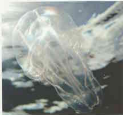
Top Barrel sponge.

Above A delicate comb jelly ( Ctenophora ).