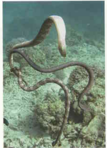
Above right Courting olive sea snakes. Two males vie for the attention of a female (top snake).

species of crustaceans, including an amazing 98 new records for the region plus two new species. The most diverse families at these reefs were the black-fingered crabs, coral crabs, spider crabs, hermit crabs and swimming crabs.