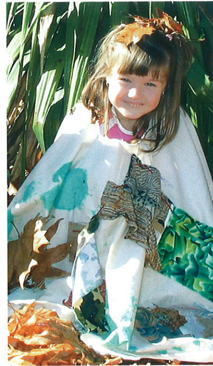
Below right Learning about nature on the coast.

view WA's underwater world without going to an aquarium but now Nearer to Nature provides opportunities to touch and feel varieties of algae, sea stars, seagrasses and other marine life, thereby increasing appreciation of this remarkable marine environment. The riverine environment is not forgotten, with activities along the Swan and Canning rivers held during the year.