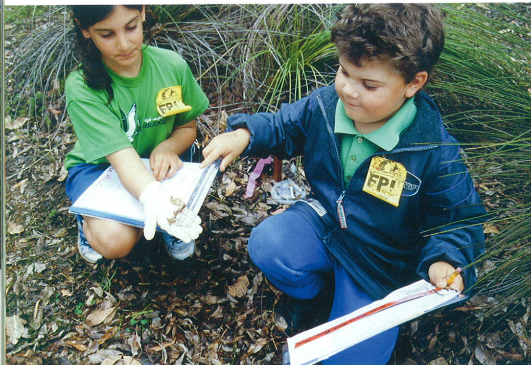
Above Students take part in EcoEducation's Forest Detective Trail.