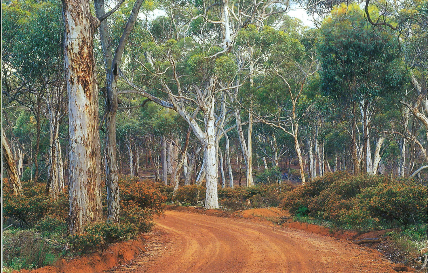
Above Wandoo woodland in Dryandra supports a woylie population.