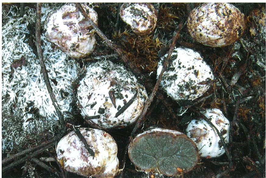
Right The common native truffle Hysterangium sp. forms part of the woylie diet.