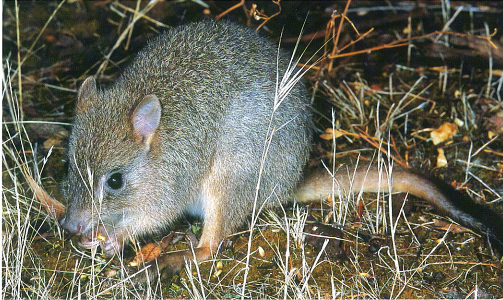
Right Woylie feeding.

Secondly, the project closely monitored Upper Warren fauna to build on, enhance and coordinate previously independent existing studies to provide information on population changes at the regional scale, while also collecting information on demographics, health, disease, diet and genetics.