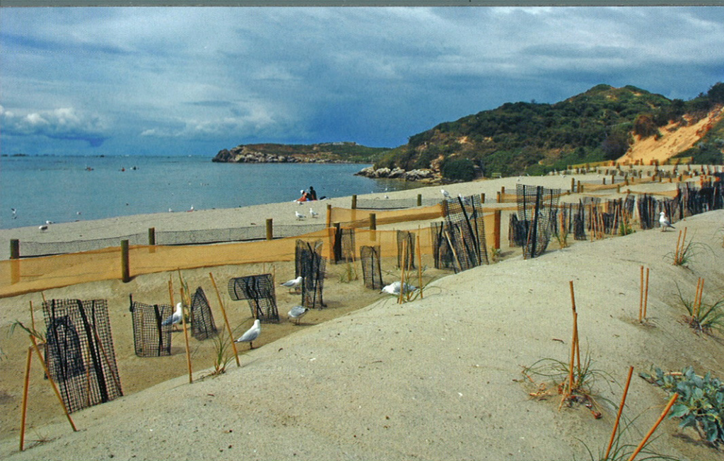
Left Beach renourishment program work on Penguin Island.