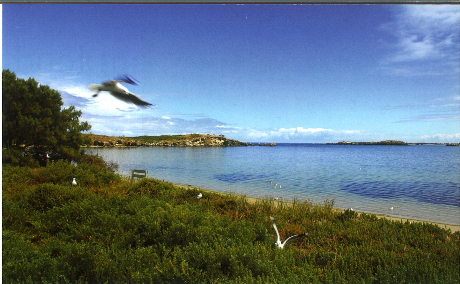
Above Penguin Island.

Last year's research may reveal a troubling trend. It showed a much lower number of breeding birds (only 112 eggs were laid in the Penguin Island nest boxes in 2008, compared with 173 in 2007). However, as about 60 new boxes were added in 2006 and penguins are less likely to use the boxes immediately, these figures cannot be compared against longer-term averages. Belinda has also recorded greater fatalities in the past year, birds weighing less than average and moulting occurring much later than usual. Little penguins must reach a certain weight before moulting begins. These factors suggest the penguins may be eating less.