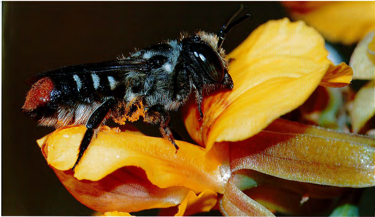
Above Native bee on stinkwood.