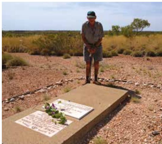
Top Python Pool, Millstream Chichester National Park.