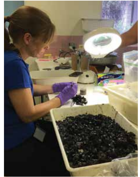
Above Toxicity assessments were undertaken on mussels, crabs, and fish from the Riverpark.