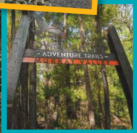
The new, 108-metre span suspension bridge across the Murray River at Dwaarlindjirraap, within Lane Poole Reserve, was a major component of the $8.4 million Dwellingup Adventure Trails project.