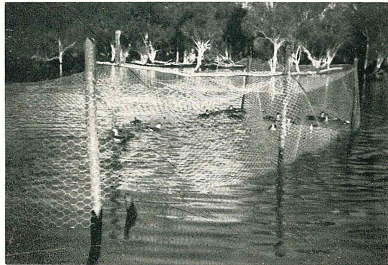
Improved deep-water stake trap (Lake Wardering)