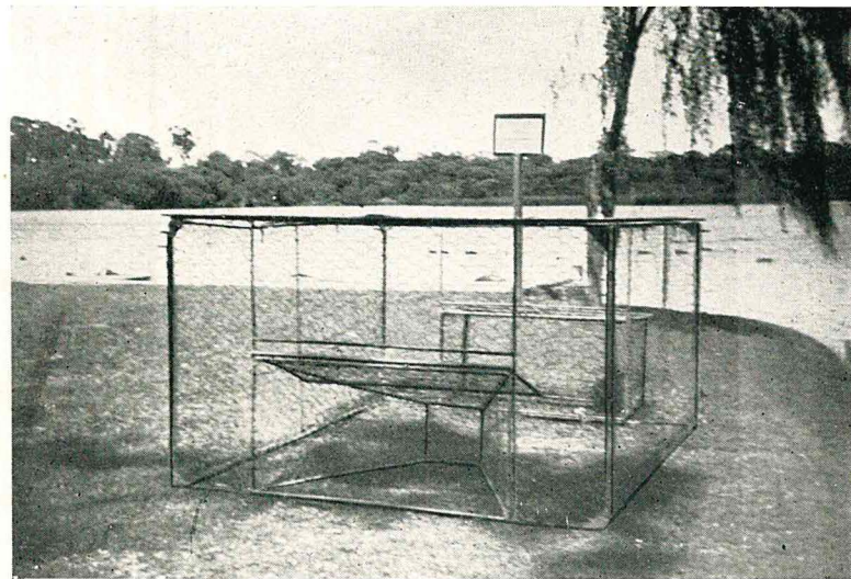
“Dry” trap, duck entering box (Yanchep)