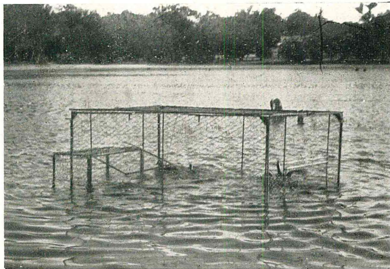
Shallow-water trap (Lake Karinyup)