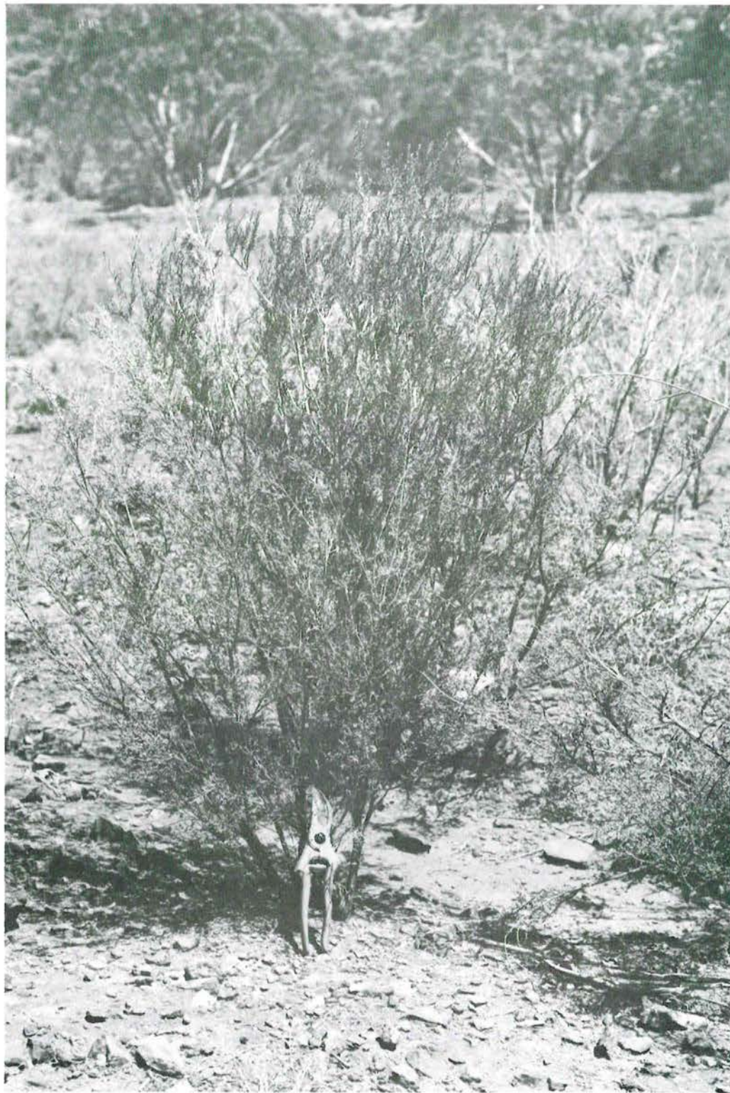
Figure 1. Eriostemon wonganensis . Growing in the Wongan Hills.