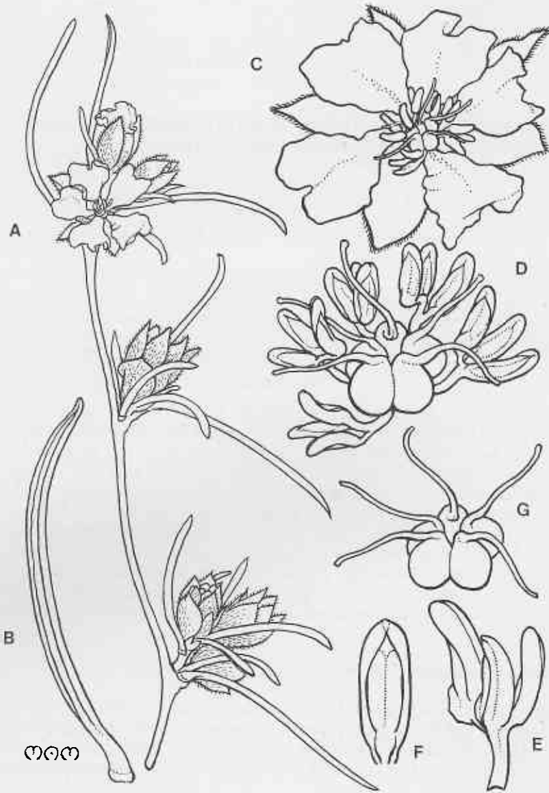
Figure 1. Hibbertia ferruginea A—Habit. B—Leaf. C—Flower. D—Flower with sepals and petals removed, showing the arrangement of stamens and carpels. E—Staminal bundle. F—Anther. G—Carpels.

From A. T. Hotchkiss, Ludlow, 4 Sept. 1953.