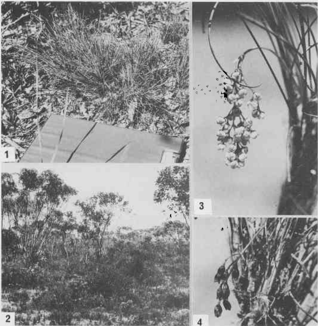
Figure 1. Habit of Lomandra nutans . Type locality. Figure 2. Habitat of Lomandra nutans at type locality. Open mallee of Eucalyptus decipiens and E. tetragona . Lomandra plants occur in the low shrub areas between the mallees. Figure 3. Male inflorescence of Lomandra nutans . Type collection. Figure 4. Part of female inflorescence of Lomandra nutans . Type collection.

bright green beneath, somewhat glaucous above, semi-terete or upper surface shallowly V-shaped, upper surface minutely papillose to puberulent, lower surface smooth, minutely papillose or puberulent; leaf base-margins shredding early into pale, usually fine, fibres; leaf apex blunt to acute, rather thin and often eroding irregularly. Male inflorescence a panicle 1/3-1/2 as long as leaves, peduncle slightly bent to completely recurved so that panicle is slightly inclined from the vertical to completely pendent, the bend sharp or smoothly curved, usually occurring in upper part of peduncle but sometimes within the panicle and involving the main axis, branches and some pedicels. Peduncle smooth to papillose, slightly to markedly flattened, with up to 10 cm exposed above leaf bases. Panicle up to 3 cm long, compact; branches usually whorled, 2-4 per node, sometimes solitary (especially at proximal