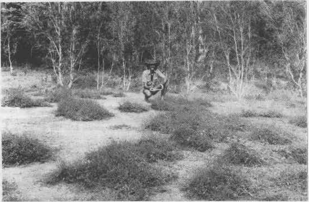
Figure 2. Nicotiana heterantha forming low spreading colonies on black clay on the edge of a Melaleuca acacioides thicket on Buckleys Plain north of Broome.

collection of N. rosulata to the new species is one from Pardoo about 400 km to the southwest. N. heterantha differs from all other Australian species except N. debneyi in its chromosome number (see below). In addition the mostly cleistogamous flowers, tufted growth, and slender wiry stems distinguish it from all other Australian species.