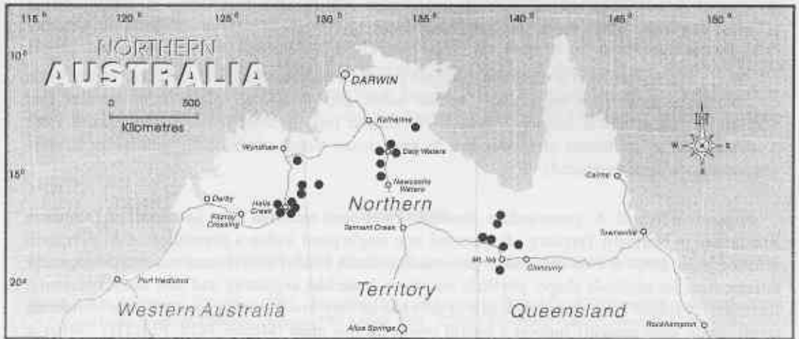
Figure 2. Distribution of Acacia thomsonii .

loams. Geological substrates include laterite, meta-sediments and sandstone. Low open woodlands, which may have Eucalyptus brevifolia F. Muell., E. leucophloia Brooker, E. pruinosa Schauer, E. terminalis F. Muell. or Lysiphyllum cunninghamii (Benth.) de Wit and a groundcover of grasses such as Triodia spp. or Aristida spp. predominate.