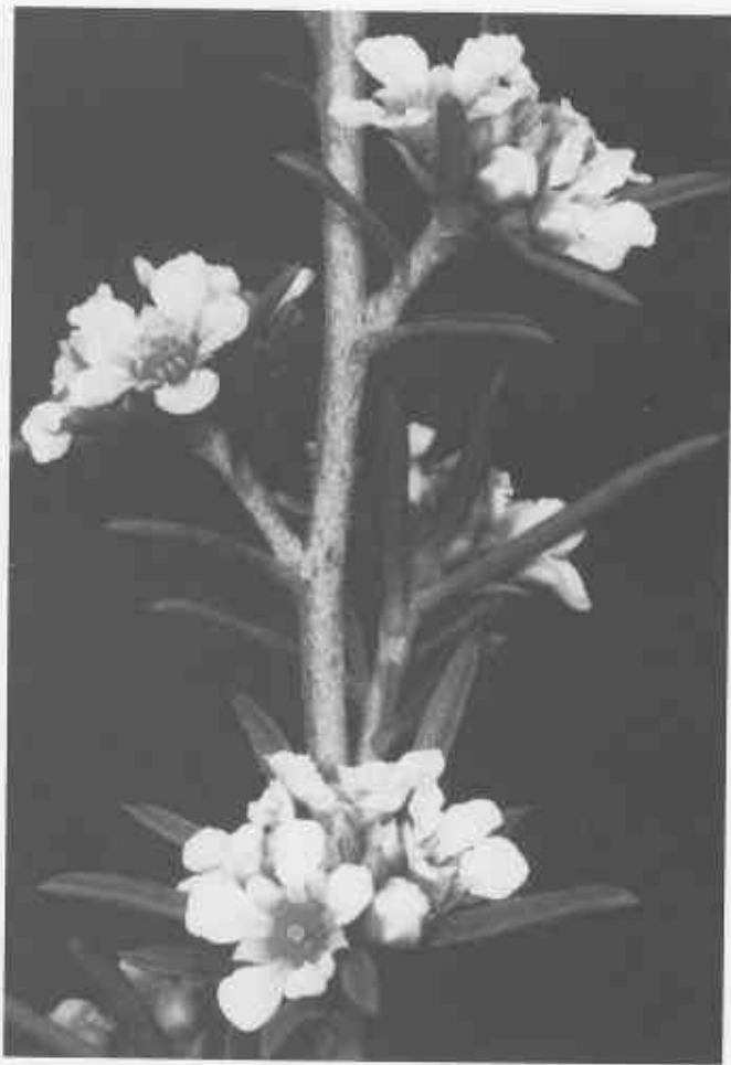
Figure 2. Photograph of flowering branch of Agonis fragrans taken by C.J. Robinson.

Selected specimens examined (all PERTH). WESTERN AUSTRALIA: Walpole–Nornalup National Park point 305, 3 May 1989, A.R. Annels 732; Plot 5022, Romance Rd, 2 km N of Break Rd, 28 km NW of Denmark, 20 Nov. 1991, A.R. Annels 2006; Payne Rd, c. 4.5 km E of Bussell Highway, c. 14 km NE of Cowaramup, 31 May 1995, B.J. Lepschi 1867 (duplicates AD, BRI, CANB, NSW, US all n.v. ); Storry Rd off Pemberton–Nannup road adjacent to private property on Donnelly River, State Forest Jasper, 23 June 1991, N. McQuoid 171; Site B53, 600 m along unnamed track off Nanga Rd, 500 m N of intersection with Willowdale Rd, 24 July 1997, G. Paull 248; N side of Kernutts Rd, 1.3 km E of Denmark–Mount Barker road and 3.6 km N of Albany–Denmark highway, 29 Jan. 1998, C.J. Robinson 1208; Peter Buxton's property, Plantaginet Location 6634 Redmond West Rd, 18 km WSW of Redmond townsite (cultivated from locally collected seed – oil voucher), 18 Feb. 1998, C.J. Robinson 1213; 135 mile post on Albany Highway (between Williams & Kojonup), Oct. 1966, W. Rogerson 292; Site 133, 2.5 km SE of Mt Johnstone, 4 Sep. 1997, D. Trenowden 195; Gum Link Rd, W of Nornalup Rd, 10 Aug. 1991, J.R. Wheeler 2667; Walpole–Nornalup National Park, Nut Rd, 1 Sep. 1991, J.R. Wheeler 2939; Walpole–Nornalup National Park, 0.5 km E of Deep River bridge, track opposite Meredith Rd, 10 Aug. 1992, J.R. Wheeler 3098.