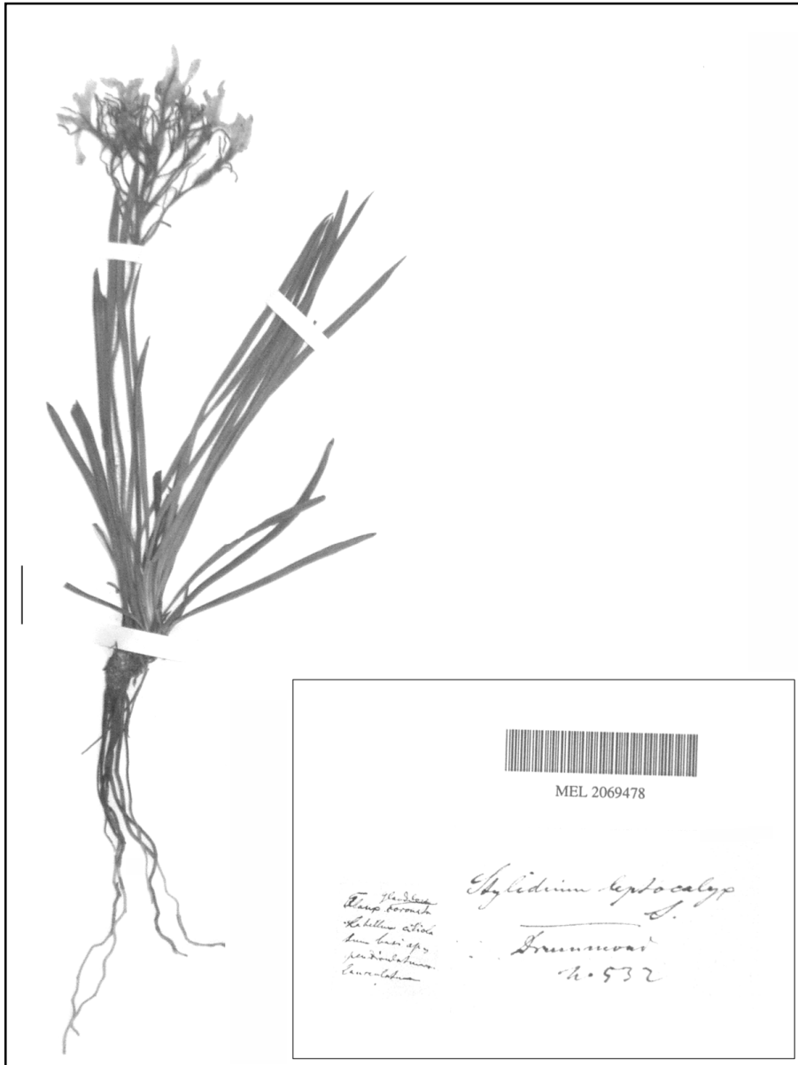
Figure 1. Lectotype of Stylidium leptocalyx (MEL 2069478). Scale bar at 1cm. Inset shows label details, with Sonder's annotation on the left.

Notes. In addition to differences in geographic distribution, Stylidium leptocalyx can be clearly separated from S. stenosepalum on account of its shorter corolla tube, shorter column, and corolla lobes that are pink and bear two sets of dark pink throat markings rather than creamy-white and with one set of throat markings. The relative size of the corolla lobes also typically differs between these species: in S. leptocalyx the posterior lobes are roughly equal in size to the anterior lobes, whilst in S. stenosepalum they tend to be slightly shorter. Sterile material can be identified with some confidence given the leaves of S. leptocalyx are usually broader than in S. stenosepalum , and bear slightly longer leaf papillae. Differences to S. scabridum are discussed under the notes for that species.