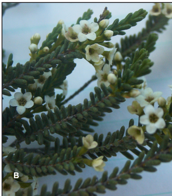
Figure 1. Micromyrtus arenicola . A – habit and habitat; B – upper flowering branches. Photographs taken in current study at the type locality.