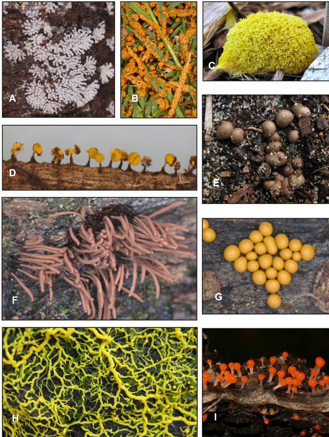
Figure 1. All figures are sporangia unless otherwise mentioned. A – Ceratiomyxa fruticulosa ; B – Badhamia foliicola ; C – Fuligo septica , immature; D – Physarum viride ; E – Lycogala epidendrum ; F – Stemonitis smithii ; G – Trichia persimilis ; H – Plasmodium, indeterminate; I – Trichia decipiens , immature.