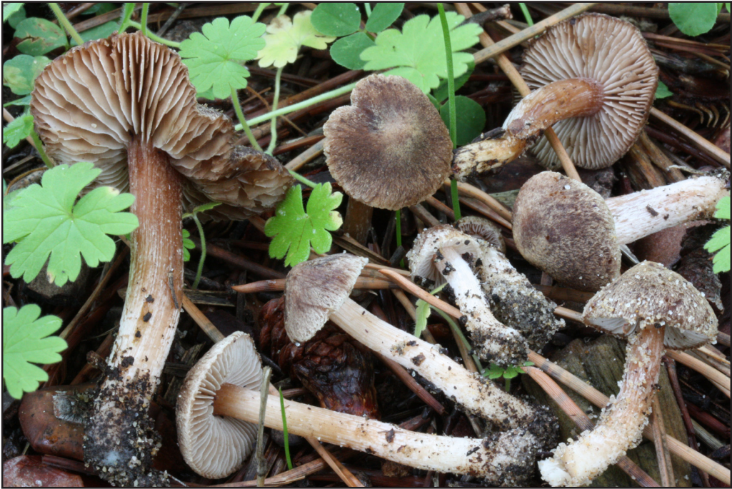
Figure 3. Basidiomes of Inocybe rufuloides (PERTH 08073147).