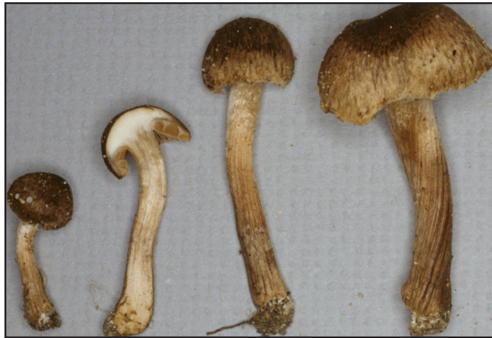
Figure 1. Basidiomes of Inocybe curvipes (PERTH 007676859).