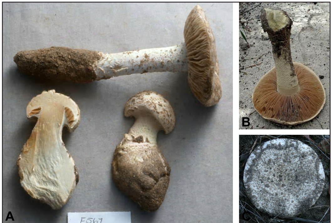
Figure 1. Amanita ochroterrea . A – showing the brownish colour of freshly exposed flesh (paratype of PERTH 07565259, O.K. Miller OKM 23747); B – Amanita ochroterrea (PERTH 08334897, B-S 168); C – surface of pileus (PERTH 08059632, E.M. & P.J.N. Davison EMD 6-2008).