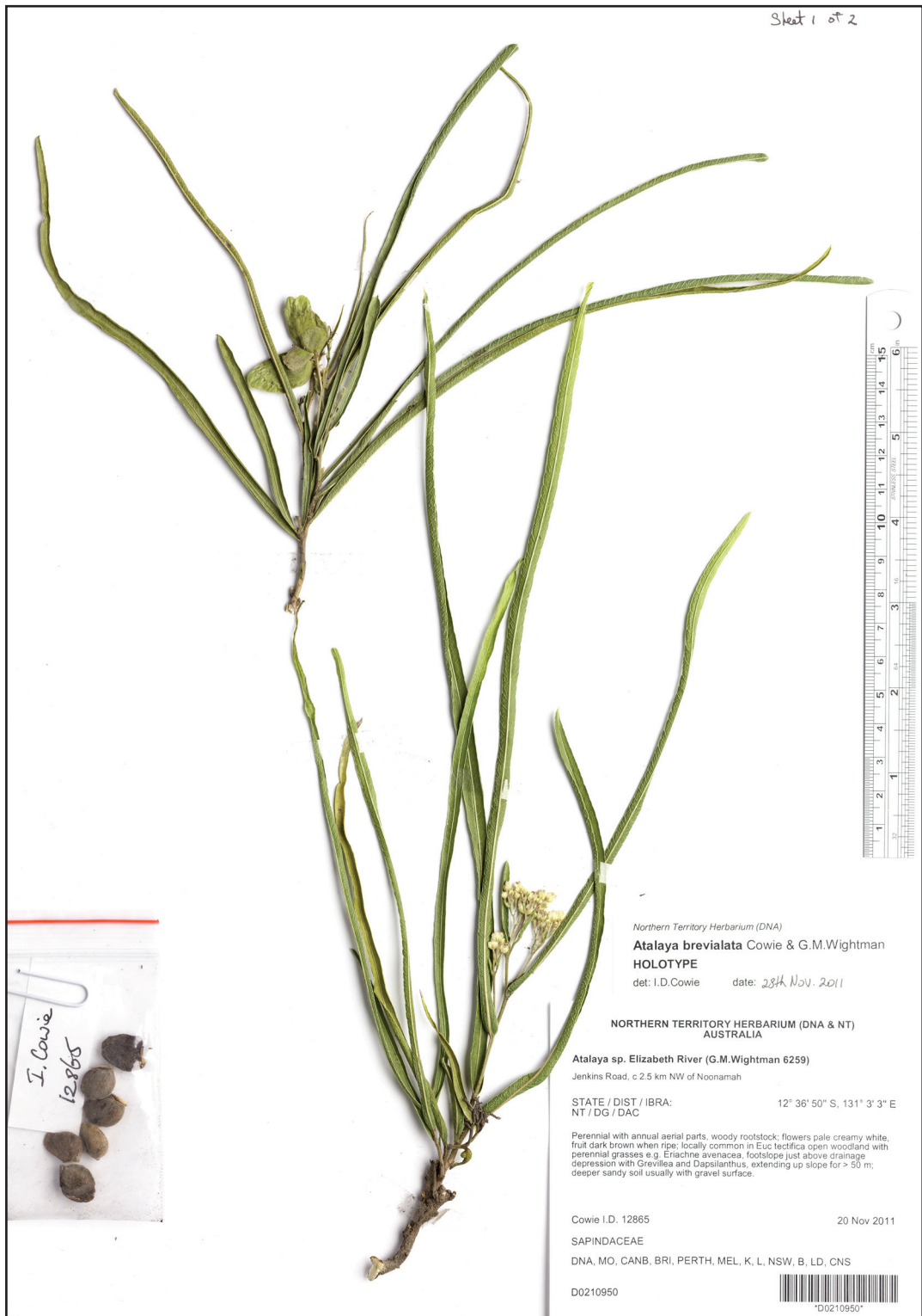
Figure 2. Holotype of Atalaya brevilata . The scale is graduated in cm (LHS) and inches (RHS). (I.D. Cowie 12865).