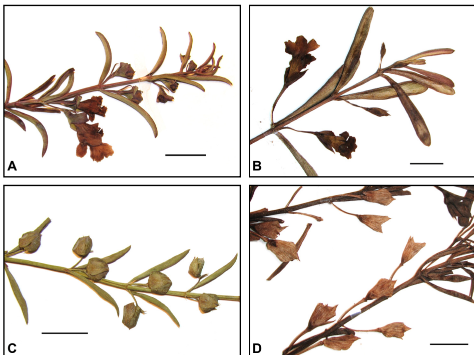
Figure 2. Hemigenia pritzelii and H. rigida . A – H. pritzelii flowering shoot showing relatively shorter pedicels and calyces and narrowly linear bracteoles; B – H. rigida flowering shoot showing relatively longer pedicels and calyces and ovate bracteoles with an abruptly acuminate apex; C – H. pritzelii post-fruiting calyces, showing rounded adaxial lip (beneath) deeply divided from abaxial lip (above); D – H. rigida post-fruiting calyces showing more elongated tube and abruptly acuminate adaxial lip more weakly divided from abaxial lip. Scale bars = 10 mm. Images from B.J. Lepschi & T.R. Lally 2382 (PERTH) (A), F.H. Mollemans 4272 & M.P. Mollemans (PERTH) (B), N. Cason & B. Evans SC 137.8 (PERTH) (C) and J. Drummond 4 th Collection, no. 146 (PERTH syntype) (D).

Conservation status. Listed as Priority One under the Department of Environment and Conservation's (now Department of Parks and Wildlife) Conservation Codes for Western Australian Flora (Smith 2012). There are only three confirmed collections of H. rigida , that of James Drummond in the early 19 th Century followed almost 150 years later by a collection in 1992, with one subsequent collection in 2012. Given that the two most recent collections have been made in reasonably well-collected areas with highly fragmented vegetation, it seems likely that this species warrants listing as Critically Endangered.