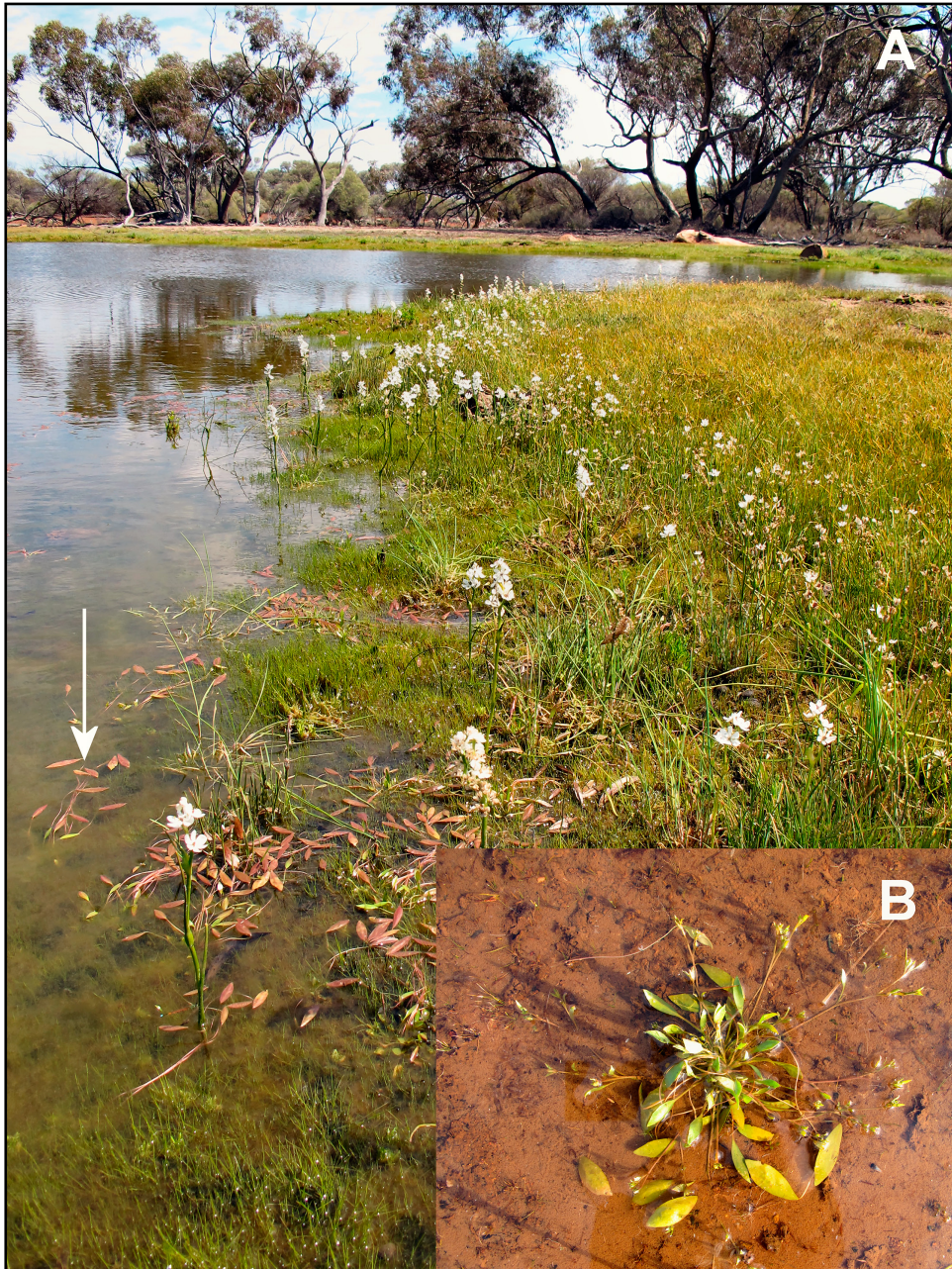
Figure 1. Goodenia berringbinensis . A – plants in aquatic phase in situ showing floating leaves (white arrow); B – as the wetland dries aquatic leaves are replaced by terrestrial leaves and flowering panicles are produced.

Gascoyne and Yalgoo bioregions (Figure 3). It differs from the typical form of the species in having consistently smaller flowers, and prostrate scapes to c. 15 cm long compared to ascending scapes to c. 30 cm. When described, G. berringbinensis was only known from two collections and was thought to have a very restricted distribution, being named from the type location at Berringbine Creek (Carolin 1990). Careful examination of the holotype (PERTH 01607197) reveals the presence of aquatic leaves