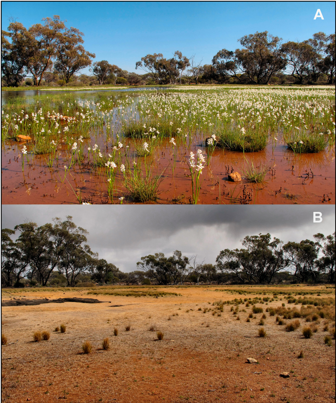
Figure 2. The ephemeral wetland north-west of Ularring Rock, Western Australia where Goodenia berringbinensis was found. A – the wetland was overflowing on 31 August 2011 following good seasonal rains. Dominant species Wurmbea murchisoniana with G. berringbinensis in the deeper pools in the distance; B – the following year (4 September 2012) was a poor season and the wetland did not fill. Goodenia berringbinensis was found on the floor and sides of the deeper basins, flowering without exhibiting the aquatic phase. Images: N. Gibson.

on the individual at the top of the sheet. The habit illustration of this species in Flora of Australia (Figure 47E, Carolin 1992) also shows what appear to be aquatic leaves citing D. Goodall 3275 (PERTH 02599945) as the collection on which it was based. However, it is likely that the illustration was based on the holotype as the Goodall collection has only mature fruiting individuals with no aquatic leaves.