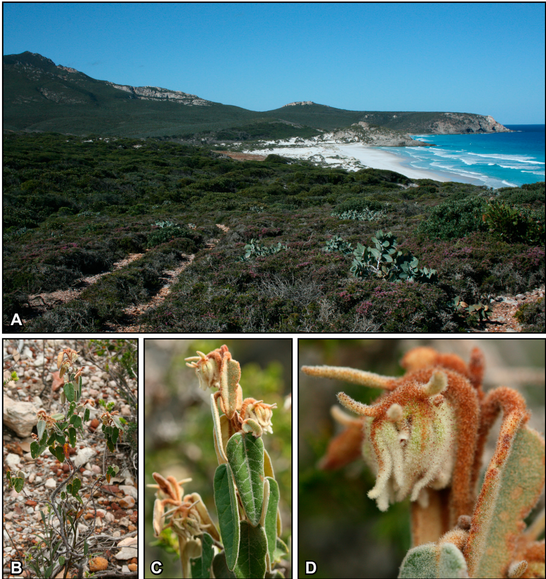
Figure 1. Lasiopetalum adenotrichum R.A.Meissn. & Rathbone. A – typical coastal habitat in Fitzgerald River National Park; B – habit; C – leaves with a smooth surface and rounded-cordate base; D – inflorescence with visible red, glandular trichomes amongst stellate hairs.

25 Sep. 2011, D.A. Rathbone DAR 883 (PERTH); 14 Sep. 2012, D.A. Rathbone DAR 956 (PERTH); 5 Oct. 2012, D.A. Rathbone DAR 981 (PERTH); 7 Oct. 2012, D.A. Rathbone DAR 898 (PERTH); 11 Oct. 2012, D.A. Rathbone DAR 893 (PERTH); 22 Nov. 2012, D.A. Rathbone DAR 983 (PERTH); 7 Sep. 1993, C.J. Robinson 1145 (PERTH).