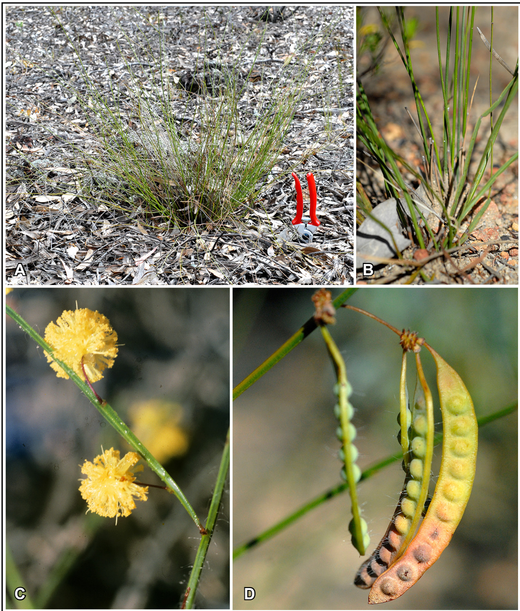
Figure 3. Acacia thieleana . A – grass-like habit; B – multiple stems at ground level; C – flower heads; D – pods.

Characteristic features. Grass-like, caespitose, multi-stemmed sub-shrub , erect or \pm prostrate. Stems gracile, little-divided, green, mostly terete to sub-terete or quadrangular, infrequently a few flattened and with a vestigial wing 0.3–0.5(–1) mm wide. Phyllodes continuous with stems, normally extremely reduced, erect, \pm terete, brown appendages 0.5–1.5 mm long, sometimes phyllodes clearly-developed