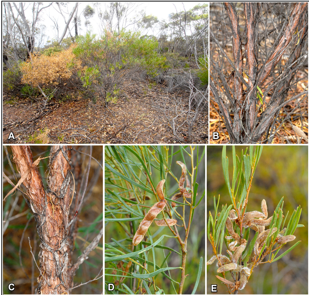
Figure 5. Acacia besleyi . A – habit (adolescent plant) and habitat; B – stem base showing multiple stems and stringy bark; C – outer grey bark exfoliating to reveal light brown new bark; D – branch showing long, narrow phyllodes and sparsely hairy pods; E – branch showing short phyllodes and densely hairy pods.

Characteristic features. Resinous shrub. Bark stringy and fibrous, grey externally, the underlying new bark light brown to reddish brown. Branchlets smooth or tuberculate, glabrous or with \pm sparse, short, antrorsely appressed hairs. Phyllodes linear but gradually and discernibly narrowed towards their base, 40–85 mm long, 2–3(–3.5) mm wide, mostly shallowly incurved, erect, glabrous; longitudinal nerves 3–5, not or scarcely raised, widely spaced with the central one normally yellow and more evident than the often impressed, brownish flanking nerves; lateral nerves absent or few, longitudinally trending with sometimes a few anastomosing; apices normally \pm abruptly contracted to a distinct, acute point. Inflorescences short racemes (1–)2–4(–6) mm long, with 2, opposite peduncles at distal end of raceme axis; peduncles 5–8 mm long, normally glabrous; heads globular, 15–22-flowered. Bracteoles 0.8–1 mm long, claws linear, abruptly expanded into ovate, concave, curved, acute to short-acuminate laminae 0.5 \times 0.4 mm. Flowers 5-merous; sepals narrowly oblong to linear, free or united near their base, \pm glabrous; petals \pm glabrous. Pods narrowly oblong, 10–30 mm long, 3.5–5 mm wide, thinly coriaceous-crustaceous, straight to variously curved or sigmoid, often \pm undulate, sparsely to densely