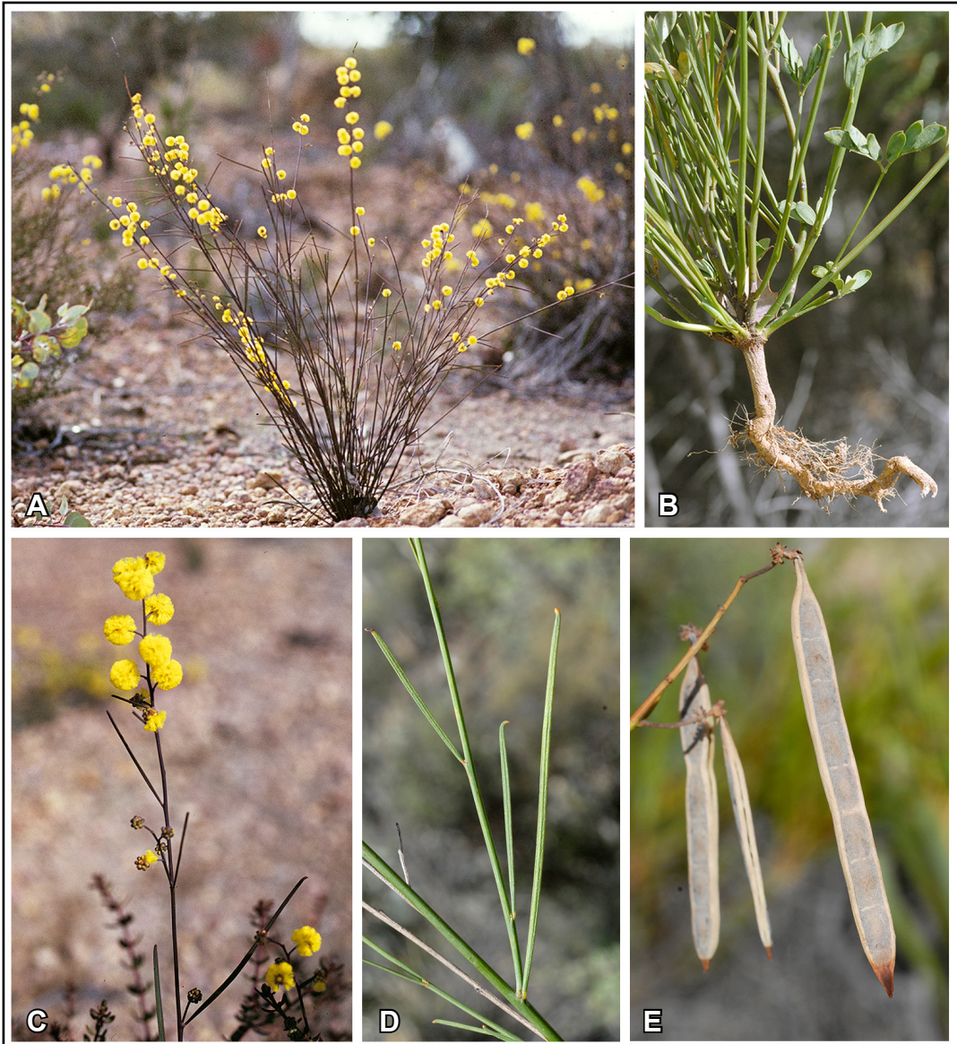
Figure 1. Acacia adjutrices . A – habit; B – stem base showing multi-stemmed base and strong main root; C – flowering branch showing inflorescences simple (lowermost node) or arranged in axillary racemes or false terminal racemes; D – branchlets with linear phyllodes; E – pods.

Phenology . Flowers in July and August; pods with mature seed have been collected from late November to mid-December.