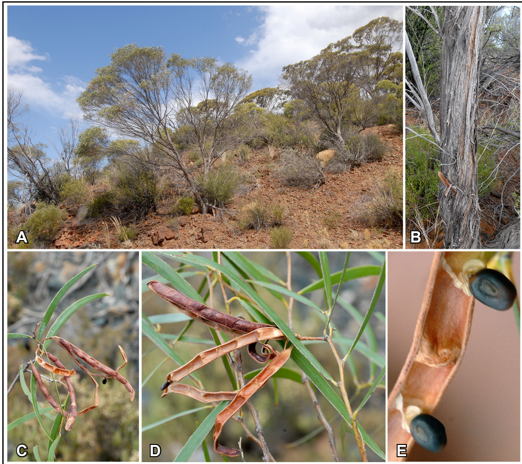
Figure 4. Acacia collegialis . A – habit and habitat; B – stem showing longitudinally fissured, fibrous bark; C – fruiting branchlet showing characteristically recurved phyllodes; D – pods red-brown with non-flanged margins; E – seeds showing heart-shaped differentiated tissue surrounding areole.

Characteristic features. Spreading shrub or tree . Phyllodes narrowly elliptic, mostly 5–8.5 cm long, 4–7 mm wide, l:w = 8-21 , falcately recurved, wide-spreading, acute to acuminate, glabrous, finely multi-striate; marginal nerve brown to red-brown, overlain by a \pm thin to thick layer of light grey, opaque resin, sometimes yellow and not resinous on oldest phyllodes. Inflorescences simple or rudimentary racemes to c. 1 mm long; peduncles (1–)2–6 mm long. Spikes obloid to short-cylindrical, 5–9(–12) mm long. Sepals free or united at base. Pods linear to narrowly oblong, 4–6 mm wide, \pm thinly coriaceous-crustaceous, \pm straight-edged, dark brown to dark red-brown (due to dense layer of glandular trichomes within a resin matrix), marginal nerve not or scarcely raised above face of valve. Seeds longitudinal in pods, with heart-shaped differentiated tissue at centre.