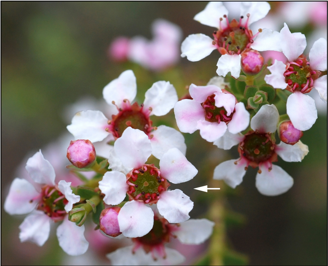
Figure 2. Ericomyrtus serpyllifolia buds and flowers at various stages, with the arrowed flower half-way through pollen release showing the partially elongated style with a greenish stigma. Images taken in Wandoo National Park; voucher B.L. Rye 281107, F. Hort & J. Hort.

A narrow-leaved variant known as Baeckea crispiflora subsp. Mt Lesueur (E.A. Griffin 2325) differs from the above description in usually having narrowly obovate to obovate leaves 4–5.5 mm long and 1–1.5 mm wide. It occurs along the north-west edge of the range of E. serpyllifolia from near Mt Adams south to near Mt Lesueur, in lateritic gravel or in sandstone habitats, but seems to overlap the range of the typical variant, with some specimens apparently intermediate. Subsp. Mt Lesueur needs to be examined in the field to determine whether it is lignotuberous, as suggested by the thickened base bearing very numerous stems on the PERTH specimen R.J. Hnatiuk 800044. A lignotuberous habit, if present, would distinguish it from all other members of the genus.