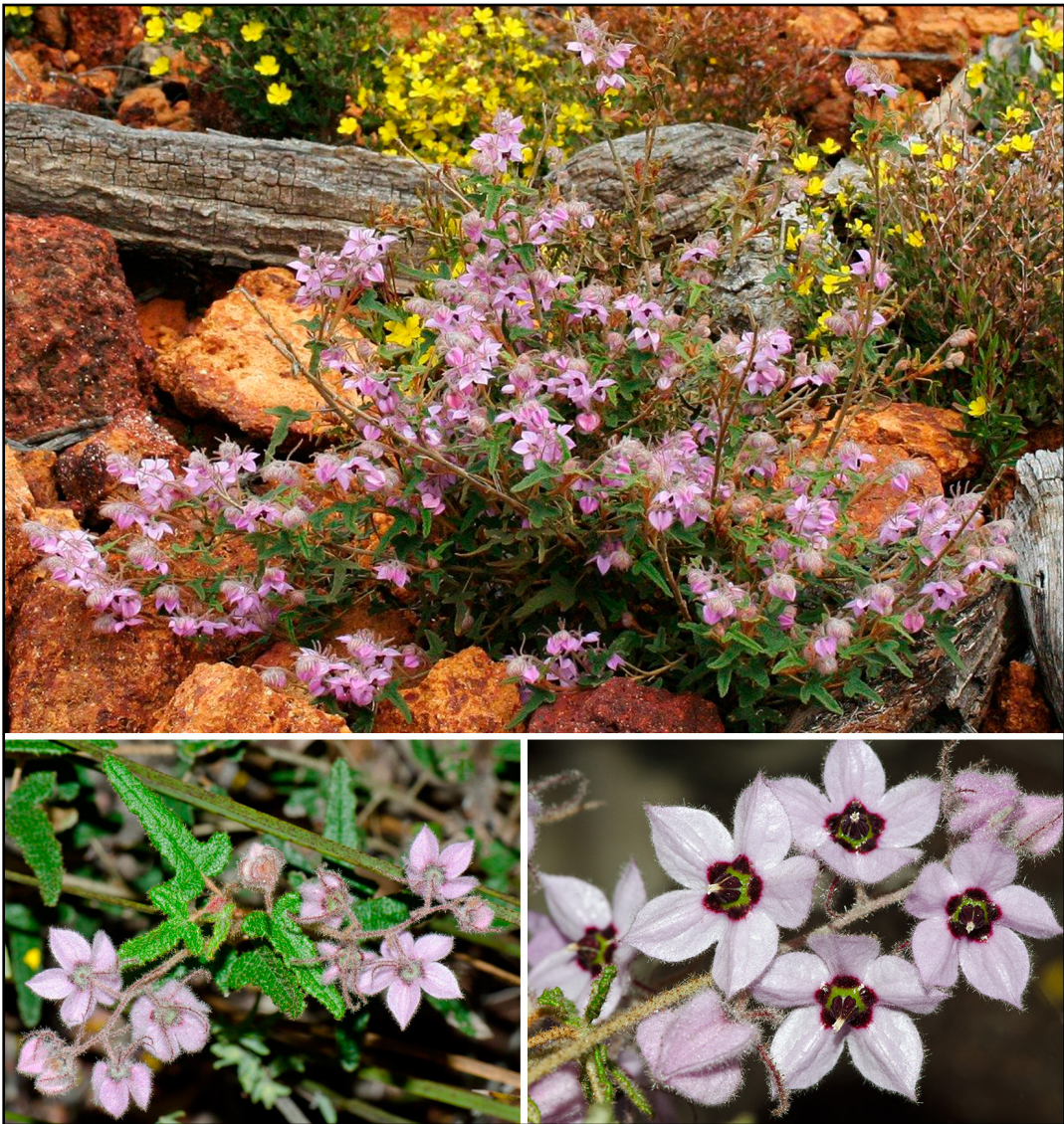
Figure 6. Lasiopetalum venustum . A – habit; B – strongly trilobed leaves and inflorescences with dense stellate hairs on the peduncles, pedicels, filiform epicalyx bracts and outer calyx; C – flowers with ovate calyx lobes and typical rostrate, dark red anthers with white apices. Images by J. & F. Hort.