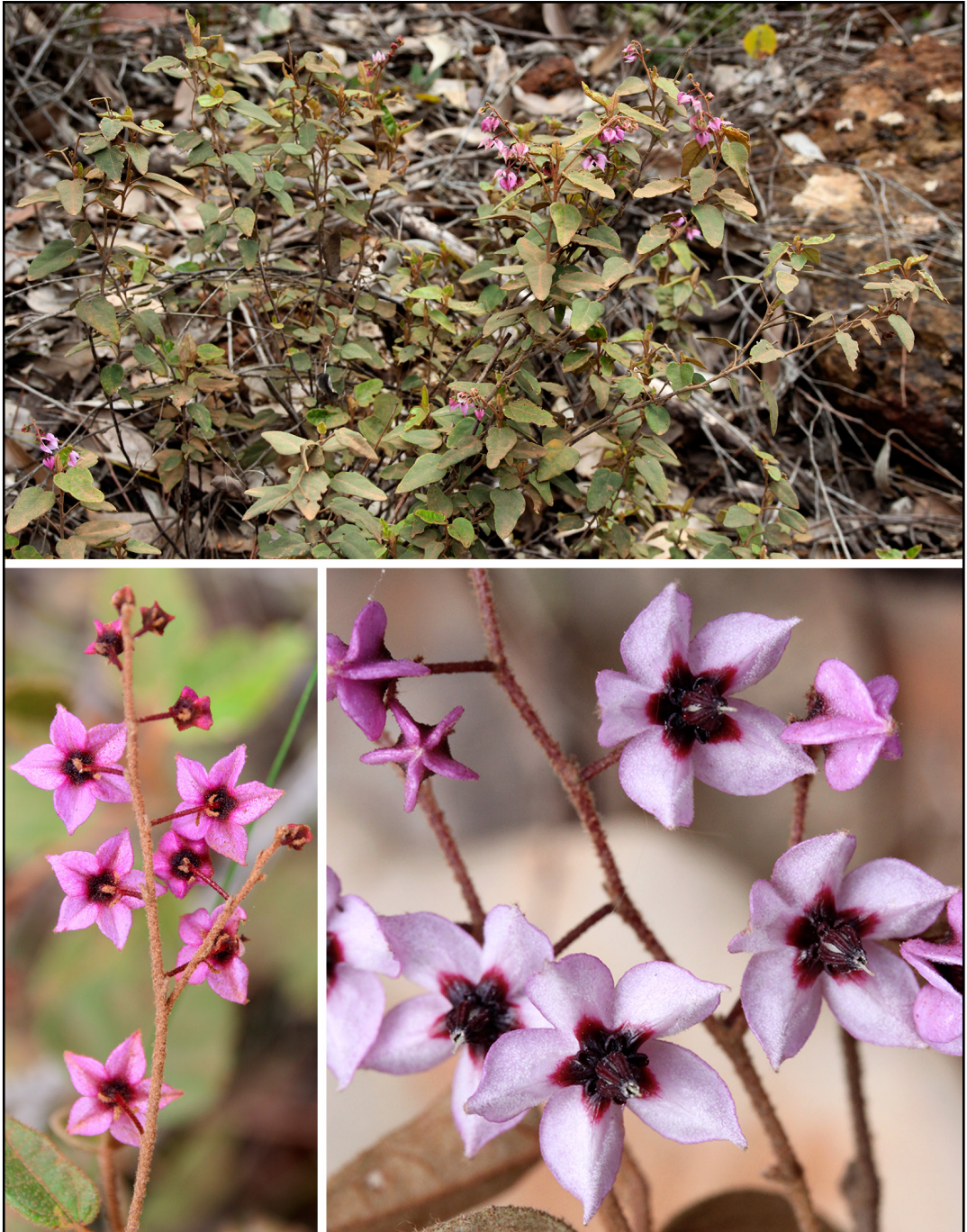
Figure 4. Lasiopetalum laxiflorum . A – habit; B – inflorescence with dense stellate hairs on the peduncles, glabrous pedicels, and very short bracts and short epicalyx bracts subtending the calyx; C – flowers showing the small, deep red petals opposite the rostrate anthers (K.A. Shepherd & S.R. Willis KS 1567). Images by K.A. Shepherd.

ovate, dark red, white towards the apex, 2.5–4 mm long, 0.5–1.1 mm wide, glabrous; pollen white. Ovary c. 1.5 mm long, 1.5 mm wide, outer surface tomentose with white, stellate hairs; inner surface glabrous. Style 2.8–4.1 mm long, 0.15 mm wide, glabrous with dense, white, stellate hairs at the base. Fruit and seed not seen. (Figure 4)