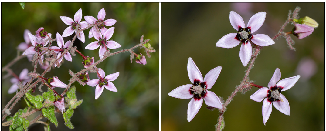
Figure 5. Lasiopetalum trichantherum . A – inflorescence with dense stellate hairs on the peduncles and glabrous pedicels; B – flowers with short, narrow epicalyx bracts at the base of the glabrous pedicel, narrowly ovate to elliptic calyx lobes and distinctive anthers covered in dense, white hairs.

Diagnostic features. The distinctive stellate hairs present on the anthers readily distinguish this species within the rostrate-anthered group. The position of the epicalyx towards the base of the pedicel rather than subtending the calyx, the narrow calyx lobes and the presence of stellate hairs on the seeds are also features particular to this species.