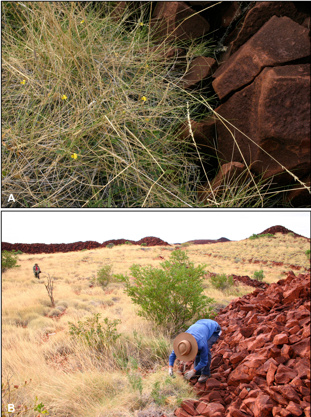
Figure 3. A – habit of Vigna triodiophila intermingled with Triodia angusta ; B – typical habitat of V. triodiophila at Harding Dam (R. Butcher in the foreground collecting the type).