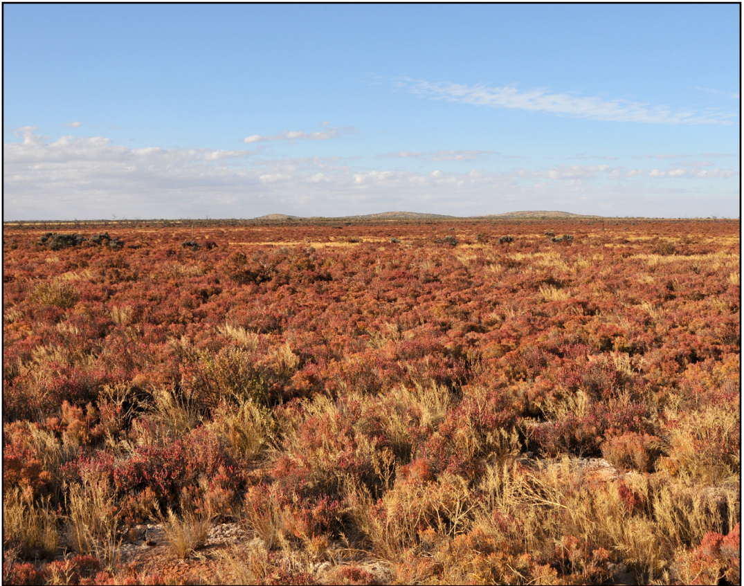
Figure 4. Typical habitat of Dysphania congestiflora at Fortescue Marsh.