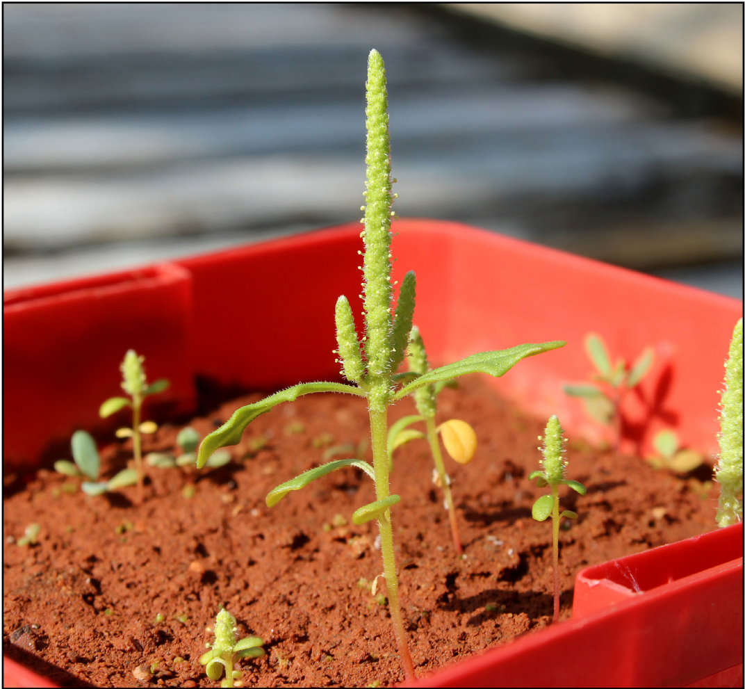
Figure 1. Dysphania congestiflora . Image from S. Dillon 6999. Photograph by S. Dillon.

Other specimens examined. WESTERN AUSTRALIA: [localities withheld for conservation reasons] 22 July 2015, S. Dillon 6999 (PERTH); 2 June 1961, A.S. George 2514 (PERTH); 14 June 2014, A. Markey & S. Dillon FM 9707 (PERTH); 22 June 2014, A. Markey & S. Dillon FM 9708 (PERTH); 16 June 2014, A. Markey & S. Dillon FM 9709 (PERTH).