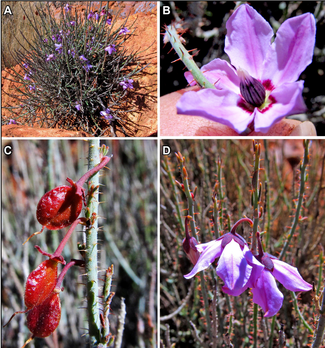
Figure 1. Tetralthea fordiana . A – habit of plant in situ ; B – single flower showing petal coloration at base, anthers and style tip; C – developing fruits in situ showing hispid peduncles, hispid and glandular-hairy outer surface, and kinked style; D – flower-bearing branches showing hispid and setose stems, hispid leaves with recurved margins, and pendulous flowers in situ showing hispid peduncles and calyces. Photographs by A. Perkins in July 2012 from plants in the West Angelas area.

There have been several Tetralthea discoveries in the Pilbara bioregion in recent years. In 2012, T. fordiana (Figure 1), which was known only from the type collection, was rediscovered in the West Angelas area growing on an ironstone cliff face and upper ridgeline. A second population of this species was subsequently found last year in a similar habitat some 35 km to the north-west. Additional serendipitous collections made in 2015 from north-west of Tom Price (Figure 2) revealed a distinct and novel species, formally described herein as T. butcheriana A.J.Perkins.